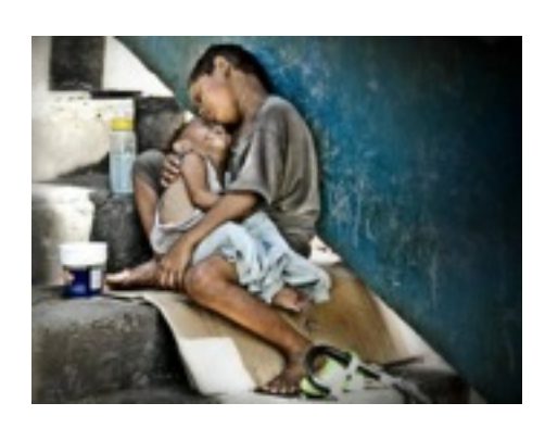
Street children in Chitwan