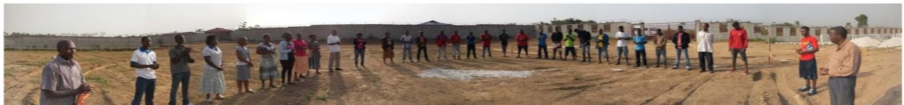
HWHL Medical Center Groundbreaking Ceremony January 7, 2015