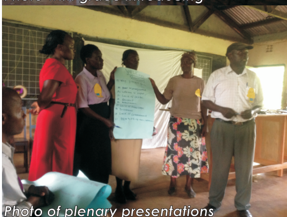
Photo of plenary presentations

an opportunity to reprimand the parents for doing FGM underground since the legal ban. At the same time it revealed how police were so corrupt that they were unable to stamp out FGM. All these unfolded in front of the deputy commissioner of police. Very serious messages were passed on amidst laughter. By the end of the day some people began telling the organizers of the event to keep doing this to stop harming our girls.