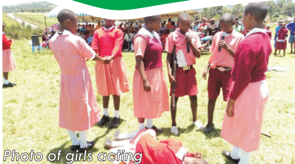
Photo of girls acting

.....Eliminating Gender Disparities to Create Strong Communities