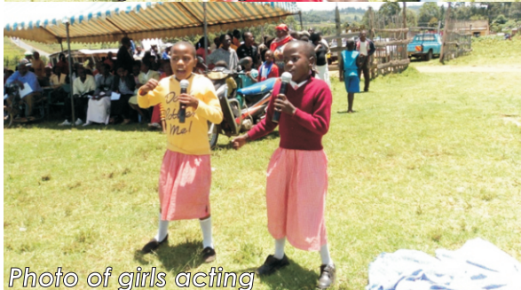
Photo of girls acting