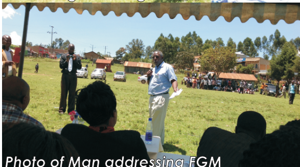
Photo of Man addressing FGM