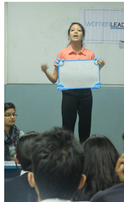
LEADer Akshyeta conducting awareness programs