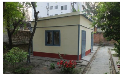
New Resource Center in Nepal

Established our Resource Center in our new office.