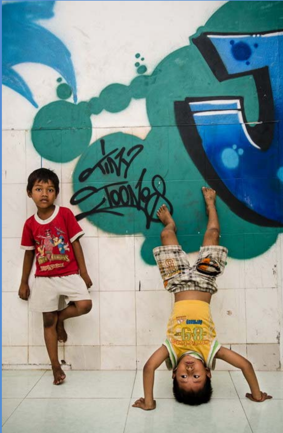
from “Tiny Toones: A school of life.”