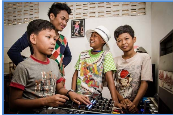
from "Tiny Toones: A school of life."

The album was entitled 'Anakut' (or 'The Future' in English) and was entirely written, produced and recorded by Tiny Toones teachers and students. The songs addressed themes like single mothers supporting their families, the problems that kids go through and how music and dance can change lives and bring about a positive future.