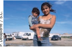
P. Delapierre / S.C.

foreigners in a precarious situation. Cedre (Centre d'entraide des demandeurs réfugiés et émigrants - Mutual aid centre for asylum seeker refugees and emigrants), a centre of Secours Catholique, provides support to asylum seekers in their procedures and offers activities that encourage integration (learning French, expression workshops, discussion, theatre groups and so on).