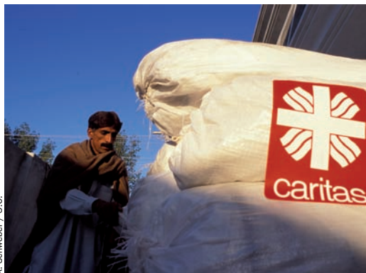
X. Schweibel / S.C.

Leading global solidarity network, Caritas Internationalis groups together 162 national Caritas agencies. A charity of the Universal Church, this international confederation, present on every continent, constitutes both an organised force capable of intervening at any given moment in most countries of the world and a