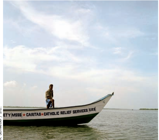
X. Schweibel / S.C.

– Acting for social transformation and justice – Experiencing the mission received in Church”. In 1998, the law on exclusion crowned several bitter years of institutional combat. In 2001, Secours Catholique participated in a massive mobilisation for the victims of AZF in Toulouse. In 2004, the Tsunami in South-East Asia led to Secours Catholique implementing actions of exceptional scope.