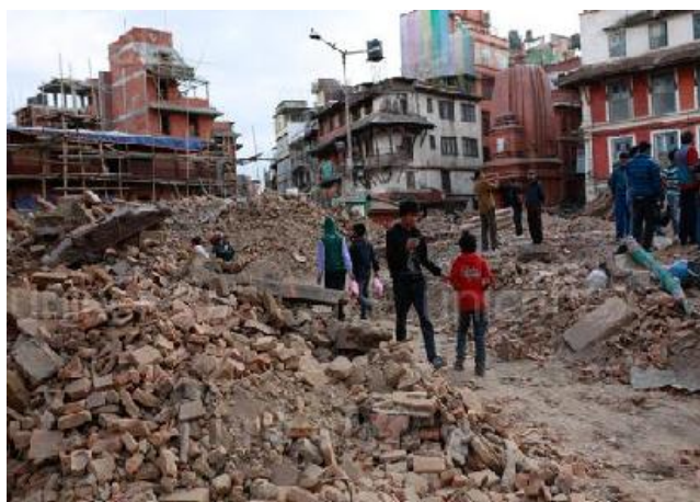
On April 26 th people walked around the historic Durbar Square destroyed by the earthquake that occurred April 25 th in Katmandu, the capital of Nepal.

The earthquake's impact has been felt in the mountain and hilly areas and by dispersed rural populations, as well as some very densely populated districts. The highest number of casualties was in Kathmandu District. Sindupalchowk, Kavre, Nuwakot, Rasuwa, and Dhading districts in the Central Region were also very hard hit. Most of the displaced population is staying in 16 informal camps in Kathmandu Valley.