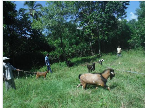
Goat breeding increases income

At this juncture we will soon be expanding our Board, so if you or someone you know has a passion for bottom up development in Haiti and a desire to fundraise in the USA, let us know!