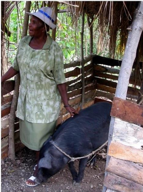
Pigs are a sign of prosperity