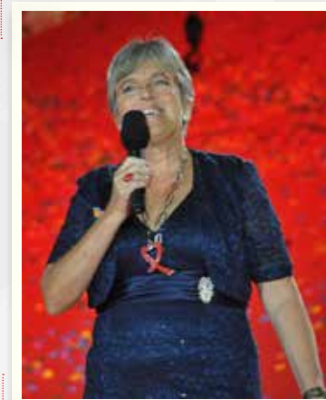
Crystal of Hope Award

2014 witnessed by thousands of international guests from the business world, fashion world, international donor community. This was widely covered by the Austrian and Dutch Media as well as Nation TV and included a photo session with former US president Bill Clinton, who supports Life Ball with his foundation. The country director was further was invited at VIP parties, champagne receptions, gala dinner and concert, red carpet walk, first ladies lunch and other build up activities. More media coverage from Procter Gamble (Its Africa Time) and Actuality Media (Positive Living) led to increased visibility and international exposure. Annual income now increased to Kes 125 million with 45 employees.