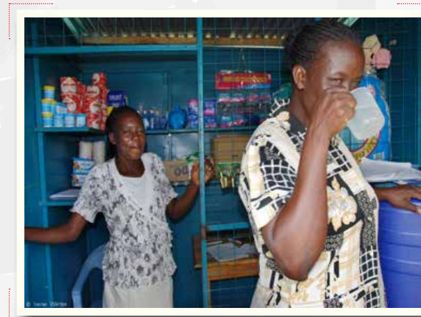
Community Health Promoters at Nyakwere Jamii Center

2005 - SWAP started operations in with 4 employees and an office within the Lutheran community center in Kisumu. Initial operations started under (SWAK) “the Society for Women and AIDS in Kenya”, targeting HIV support groups and introducing them to Safe water systems. First product in the “basket of goods” was Klorin (Chlorine Solution) which we procured from CARE, which was later branded as Waterguard by Population Services International. Our first funding was received from Rotary Atlanta channeled via Rotary Club District 9200 in Nairobi. Annual income from grants first year was less than Kes 5 million.