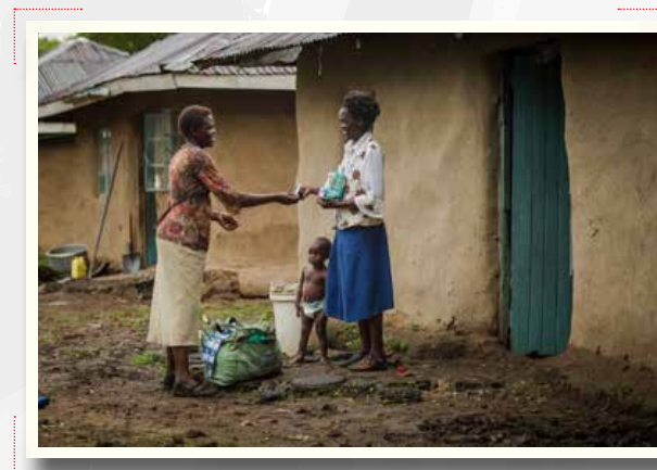
Community Health Promoter during door to door sales

2006 - SWAP gained independency and first registered as a Trust while working on the registration requirements as an NGO with the NGO Coordination Board, which materialized in June 2006. SWAP increased its basket of goods with Procter & Gamble (P&G) and Population Services International (PSI) products and in the first years worked with KREP microfinance for micro loaning to the HIV support group members. During this period SWAP expanded its operations to Rachuonyo & Wagai. SWAP set up an emergency response program which responded to various cases within the region e.g. Cholera, floods and other calamities. SWAP organized the first Kisumu World AIDS Marathon which became an annual event held on World AIDS Day. SWAP received Melinda Gates visiting the program and one of SWAP’s kiosks in Nyalenda slums.