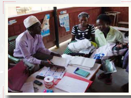
Antenatal Care Study - Saving Lives at Birth Award

2012 - The research team did two follow up studies on Water/Hygiene in Antenatal Care (SWANC) in Suba and Mbita, Hand washing and hygiene in schools (CHAK/UNICEF), two surveillance studies (Life Straw and Hand Towel) a Chlorox study. (Testing free chlorine in water in households).