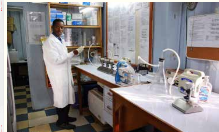
SWAP'S Water Lab

2009 - Research team started an Immunization Study (SWEPI) in Homa Bay and Suba. They also did a hand washing hygiene/water treatment study at clinics in Homa Bay. Life Straw study continued in Nyando.