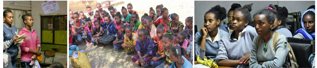
DELIVERING 250 KITS