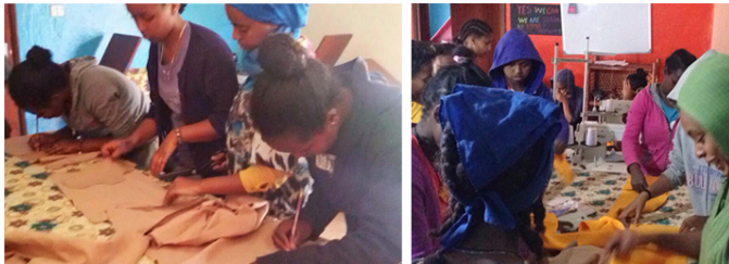
PREPARING MENSTRUAL KITS