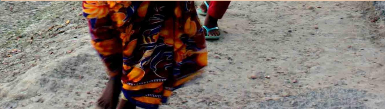
Most of the Sundarbans coastal women engage with drinking water collection far away from their home