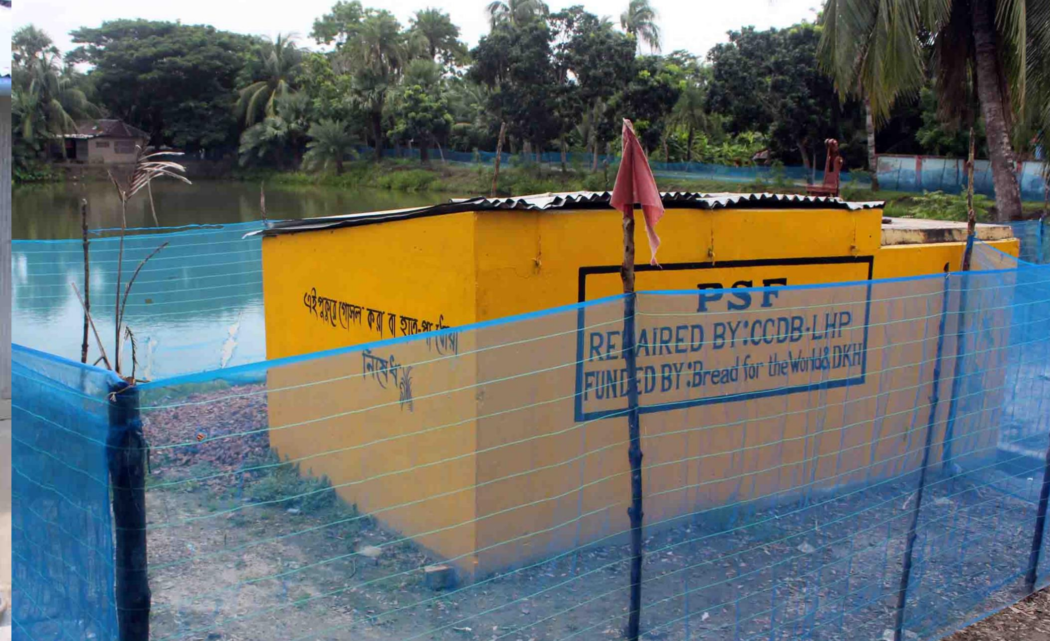
Local technique of water purification called PSF (Pond Sand and Filter)