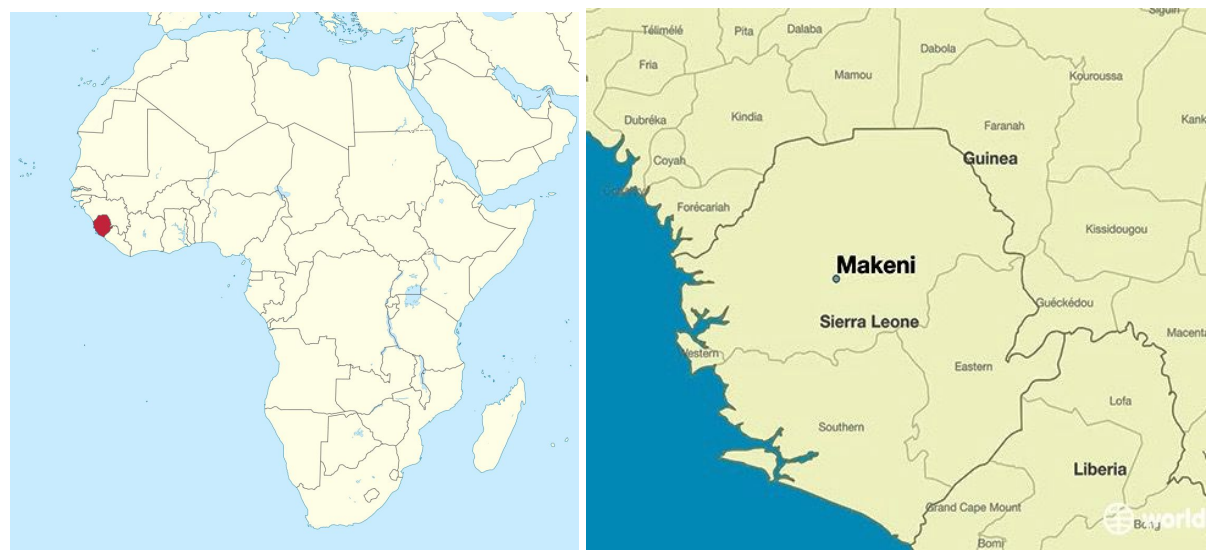
Figure 1 – Sierra Leone

Though Makeni is the economic centre of this province, most of the population works in the agricultural sector and the informal sector with a mere 30% of households having access to clean drinking water, 10% having access to hygienic toilet facilities, and only 2% having electricity. Having a structure that doubles as both a school and community centre will enrich the lives of the children, the local population, and act as a cultural hub for those in need.