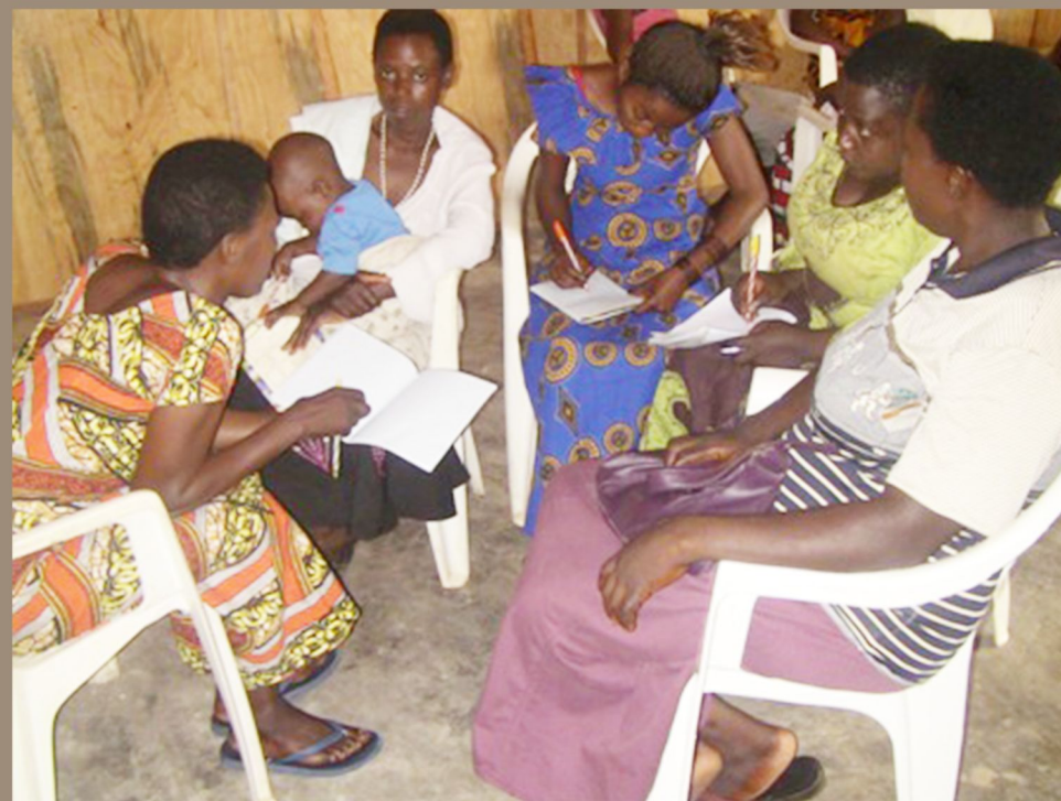
Small groups during the workshop

Six trauma healing workshops, free medical care and home visits were done for GBV survivors. Five self-help groups are now functioning. This is a way to empower women economically