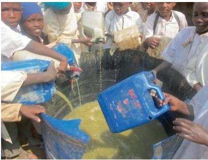
Dirty Drinking Water at a School in Darfur