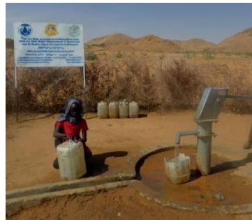
Clean Water Flowing from a Kids for Kids Handpump