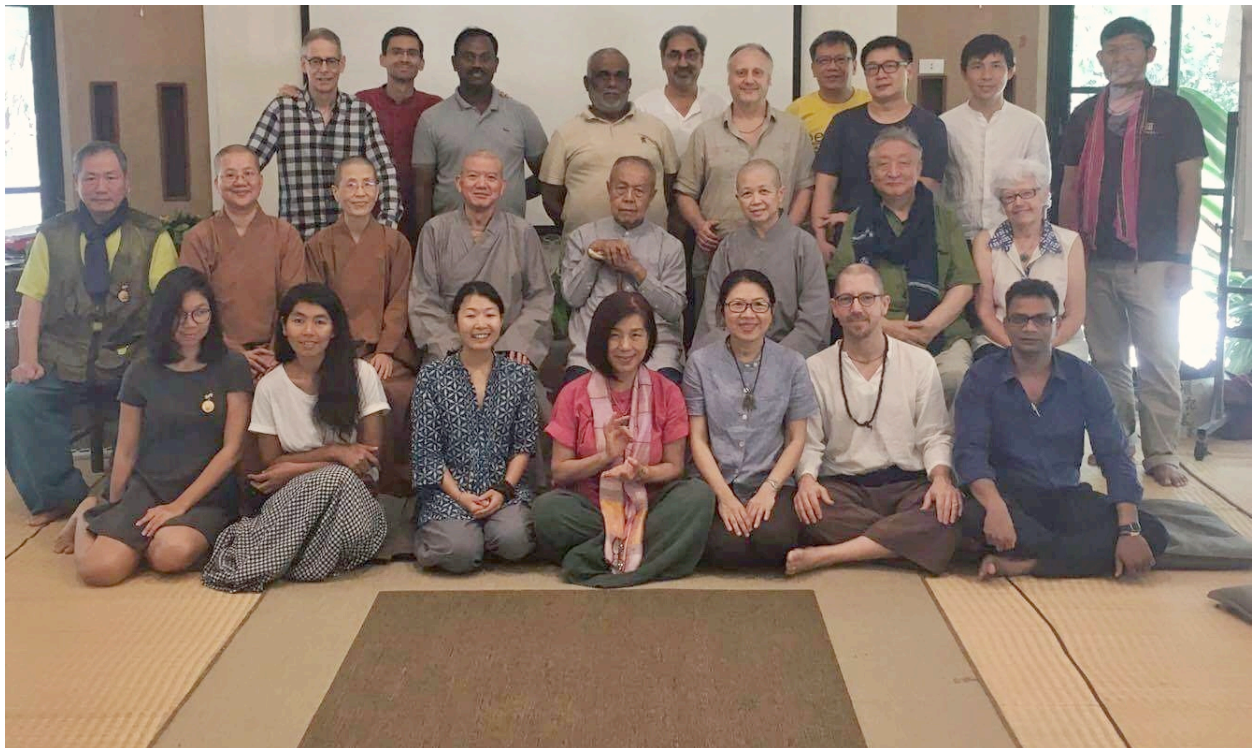
a retreat and workshop of core INEB member, from March 14-16, 2017 at the Wongsanit Ashram

From October 11-14, 2016 At the Conference on Social Engagement and Liberation, commemorating the 60th anniversary Dr. Babasaheb Ambedkar's Conversion to Buddhism at the Nagaloka Instiute in Nagpur, India, a group of core INEB members held informal discussions about the need for INEB to develop a more systematic approach to its growing initiatives. We asked questions like, What must be addressed for INEB to continue to function as a “network” oriented organization? Is there a need to develop a more centralized body to manage network activities and other projects? Or is there a need for a more hybrid model? There were also important questions raised about how to better maximize the impact of INEB’s grassroots work, which doesn’t often translate on to higher levels of social policy making. In this way, we also questioned how organizationally INEB might better manage its initiatives by identifying and empowering the right leaders for them.