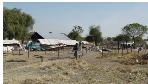
Support pilings at the new TB clinic site. Plans below.

Please consider a donation today for all of our ongoing projects: clean water, agriculture development, vocational training and the new tb clinic. Thank you. Together we're making a difference!