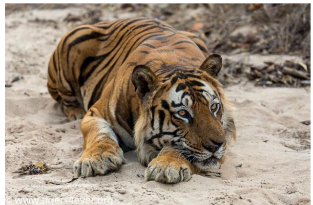
An alpha male tiger resting in a dry river bed in May

When there is inadequate water to sustain prey, numbers fall as the mating season is delayed until there is adequate food and water to feed their young. Adult deer, etc., search for water to sustain themselves leading them into villages where they raid crops and drink from human water sources. This leads to human-animal conflict. Tigers and leopards follow their prey into the villages but when the prey absconds the predators kill livestock leading to further human-animal conflict. Angry villagers are known to lay traps/snares to prevent crop raiding/livestock predation which leads to the death of wildlife including tigers. Villagers are also known to poison carcasses so that the tiger and its cubs will die when they return to finish their meal.