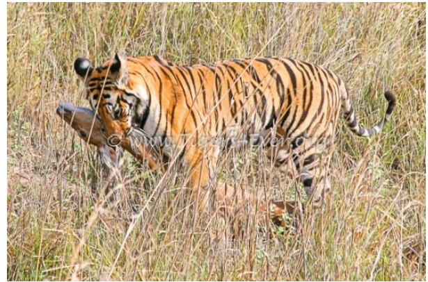
A young tigress with her prized kill – a chital

water for tigers and their prey. This also provides somewhere for them to hunt.