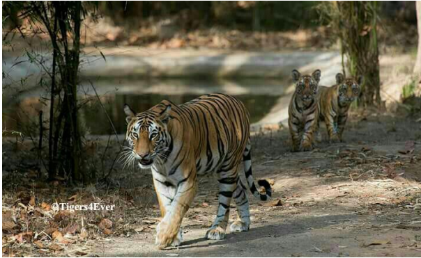
A tigress with 2 of her 3 cubs at a manmade waterhole.

orphaned cubs would not become habituated to human invention (water tankers) and will provide long term year-round water for other wildlife in an otherwise dry area. Without this waterhole tigers and other wildlife would enter the villages in the nearby buffer forest in search of water and food.