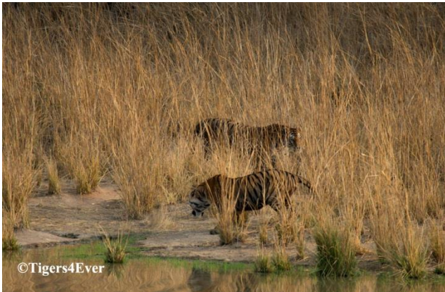
An adult tigress (left) and an unrelated sub-adult cub (female, right) at the large Tigers4Ever funded waterhole in June 2018.

In May/June 2018 Tigers4Ever visited the waterhole sites and saw four different tigers at the large waterhole alongside countless other wildlife.