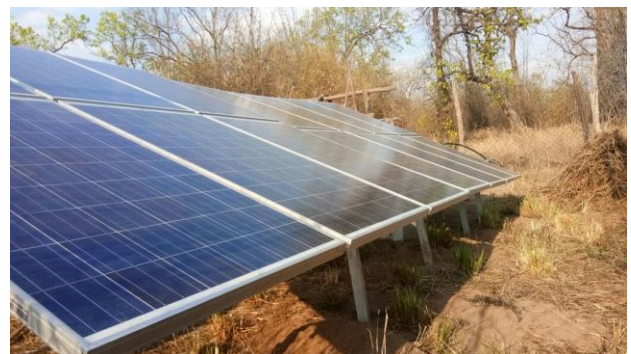
Solar Installation at the large natural waterhole site in April 2018.

On completion of the waterhole project in March 2018, Tigers4Ever was asked to help with another waterhole in an extremely dry area. This was a naturally occurring waterhole which was completely dry by February for the first time in our memory. In fact, although very little water was usually left by June it hadn't previously been completely dry in over 11 years. At least five tigers were completely dependent on this waterhole with a further three tigers occasional visitors because of territory overlaps. One of the tigresses who uses the waterhole was also due to have cubs in May 2018. Countless other wildlife is also dependent on this waterhole as it is in one of the driest areas of Bandhavgarh. Tigers4Ever was asked to fund the cost of a solar powered borehole pump at this site as a matter of urgency. Work commenced at this waterhole site, funded by Tigers4Ever, and was completed on 05 April 2018.