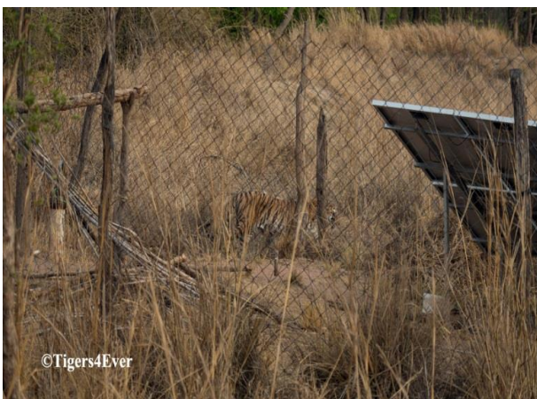
An adult tigress walking past the solar panels and borehole pump funded by Tigers4Ever at the large waterhole (June 2018).

As a result of Tigers4Ever funding the two waterholes, the forest department was able to seed two grasslands (with funds which would otherwise been spent on the waterholes), providing food for thousands of prey. This in turn helps to reduce human-animal conflict as prey does not need to look elsewhere for grazing. The Field Director said that the large waterhole had saved the lives of at least 5 tigers which otherwise would have entered villages in the nearby buffer in search of prey and water.