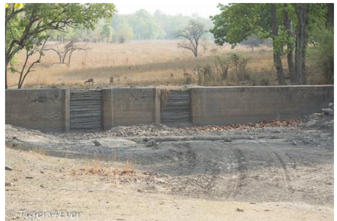
This waterhole was completely dry on both sides of the dam wall in May 2018.

The Field Director and his deputy have reiterated the need for more wildlife waterholes all over Bandhavgarh National Park especially with so many sub-adult tigers and cubs which will need their own territories in due course. Tigers4Ever has been asked to raise funds to provide permanent wildlife waterholes at two further locations in the core protected area at an estimated cost of up to £10100 (US$14000) each.