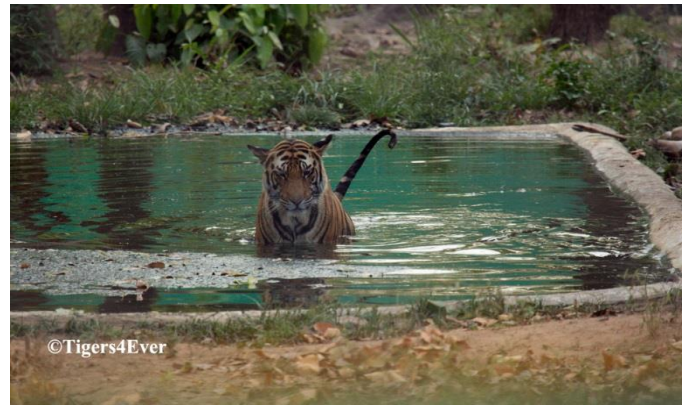
One of the orphaned cubs in the Tigers4Ever funded waterhole in June 2018 (the leg of the tiger's kill: a deer can be seen top right).

On completion of the waterhole project in March 2018, Tigers4Ever was asked to help with another waterhole in an extremely dry area. This was a naturally occurring waterhole which was completely dry by February for the first time in our memory. In fact, although very little water was usually left by June it hadn't previously been completely dry in over 11 years. At least five tigers were completely dependent on this waterhole with a further three tigers occasional visitors because of territory overlaps. One of the tigresses who uses the waterhole was also due to have cubs in May 2018. Countless other wildlife is also dependent on this waterhole as it is in one of the driest areas of Bandhavgarh. Tigers4Ever was asked to fund the cost of a solar powered borehole pump at this site as a matter of urgency. Work commenced at this waterhole site, funded by Tigers4Ever, and was completed on 05 April 2018.