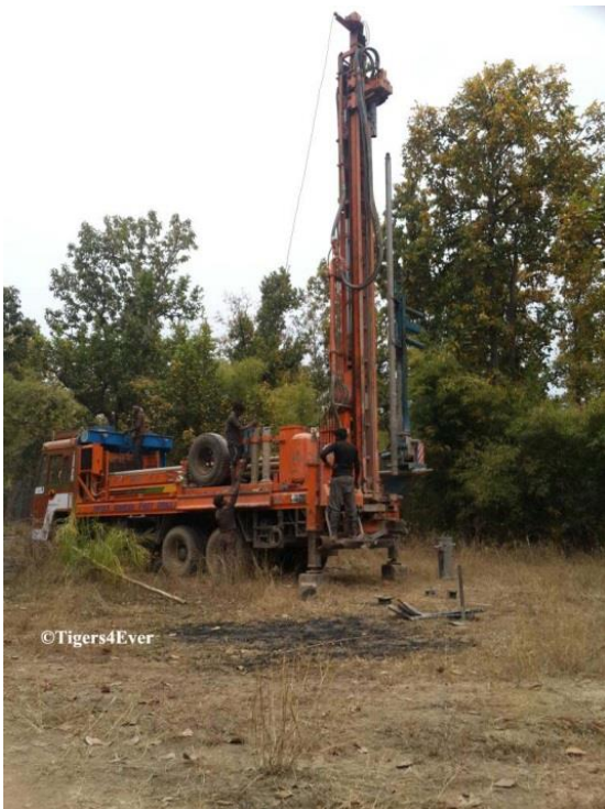
Drilling the borehole at the Tigers4Ever funded waterhole in February 2018.

Work on this waterhole was completed in March 2018.