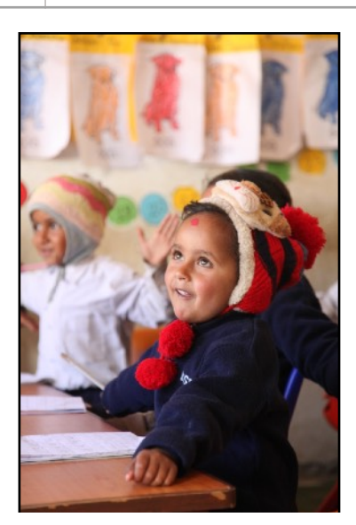
We now have 47% female students