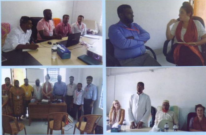
ডিডিইএফ এর প্রশিক্ষণ কার্যক্রমে বিদেশী বন্ধুদের উপস্থিতি

ডিডিইএফ কার্যালয়ে বিভিন্ন দাতা সংস্থার প্রতিনিধিদের সাথে দ্বিপক্ষীয় সভাঃ