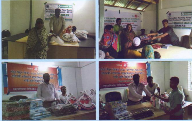
ডিডিইএফ কার্যালয়ে ইদপূর্ব উপকরণ বিতরণ করা হচ্ছে।

ডিডিইএফ এর আর একটি অন্যতম কাজ হচ্ছে প্রতিবছর রমজানে দরিদ্র প্রতিবন্ধী ব্যক্তির ও বিধবা মহিলা এবং কৃষকদের মাঝে চাল, চিনি, সেমাই, ডাল ও শাড়ি-দুপ্পি বিতরণ করা। এতে প্রতিবছর প্রায় ৫০০ জন ব্যক্তি উপকৃত হয়।