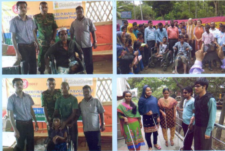
ডিডিইএফ কর্তৃক প্রতিবন্ধী ব্যক্তিদের মধ্যে বিনামূল্যে হুইল চেয়ার ও অন্যান্য সহায়ক উপকরণ বিতরণ করার স্বচিহ্ন প্রতিবেদন।

প্রতিবন্ধী ব্যক্তিদের মধ্যে বিনামূল্যে সহায়ক উপকরণ প্রদানঃ ডিডিইএফ চলমান কার্যক্রমের মধ্যে একটি গুরুত্বপূর্ণ কাজ হচ্ছে অচ্ছসল দরিদ্র প্রতিবন্ধী ব্যক্তিদের মধ্যে বিনামূল্যে সহায়ক উপকরণ যেমনঃ হুইল চেয়ার, ট্রাই সাইকেল, ক্রাচ, গ্যালবো ক্রাচ, সাদাছড়ি বিতরণ। দেশী ও বিদেশী সংস্থার আর্থিক সহযোগিতায় এই কার্যক্রম পরিচালনা করা হয়। এ যাবৎ ডিসেম্বর ২০১৮ পর্যন্ত প্রায় ১২৭৫টি বিভিন্ন ধরনের সহায়ক উপকরণ প্রতিবন্ধী ব্যক্তিদের মধ্যে বিনামূল্যে বিতরণ করা হয়েছে।