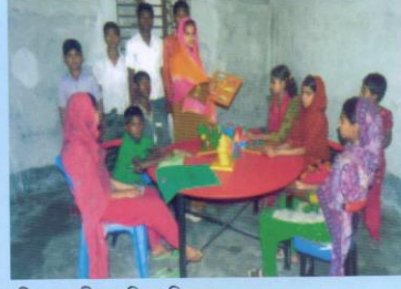
ডিডিইএফ স্কুলের শিক্ষকগণ প্রতিবন্ধী ছাত্রছাত্রীদের শিক্ষা দিচ্ছেন।