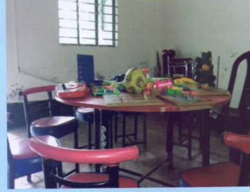
ডিডিইএফ কর্তৃক পরিচালিত রায়হানপুর ডিজেএবল স্কুল এর শিক্ষা উপকরণ

“প্রতিবন্ধী শিশুদের স্কুলে পাঠানো অভিভাবকদের নৈতিক দায়িত্ব”