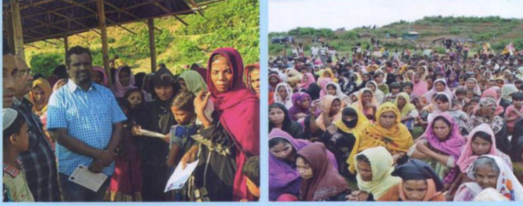
নারী ও শিশু রোহিঙ্গা জনগোষ্ঠি ক্যাম্পে খাবারের জন্য অপেক্ষমান।

ডিডিইএফ ২০১৭ সাল হতে কক্সবাজার জেলায় মায়ানমার হতে আগত রোহিঙ্গাদের পূর্ণবাসন কাজ করে আসছে। দেশী ও বিদেশী দাতা সংস্থার আর্থিক সহযোগিতায় এই কার্যক্রম পরিচালনা করা হচ্ছে। এ পর্যন্ত ৫০০ জন রোহিঙ্গা জনগোষ্ঠি এই প্রকল্পে সুবিধা গ্রহণ করেছেন।