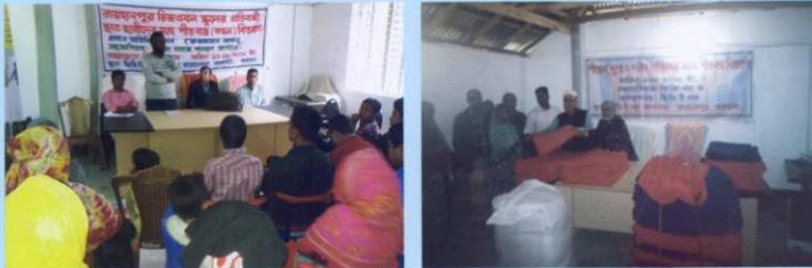
রায়হানপুর ডিজেবল স্কুলের প্রতিবন্ধী ছাত্র/ছাত্রীদের মাঝে শীতবস্ত্র বিতরণ করা হচ্ছে

গ্রামের দরিদ্র প্রতিবন্ধী ব্যক্তি, কৃষক ও বেকার যুব মহিলা বিধবা মহিলাদের মধ্যে শীত বস্ত্র বিতরণ করা হয়। প্রতিবন্ধী ৪০০ জন এই সুবিধা ভোগ করছেন। দেশী ও বিদেশী বিভিন্ন দাতা সংস্থার মাধ্যমে এই কার্যক্রম পরিচালনা করা হচ্ছে।