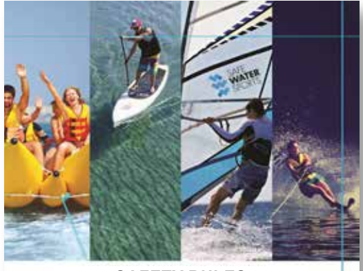
SAFETY RULES FOR WATER SPORTS