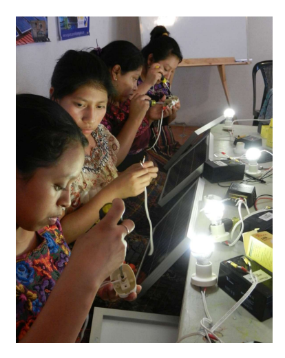
Solar Power Lesson