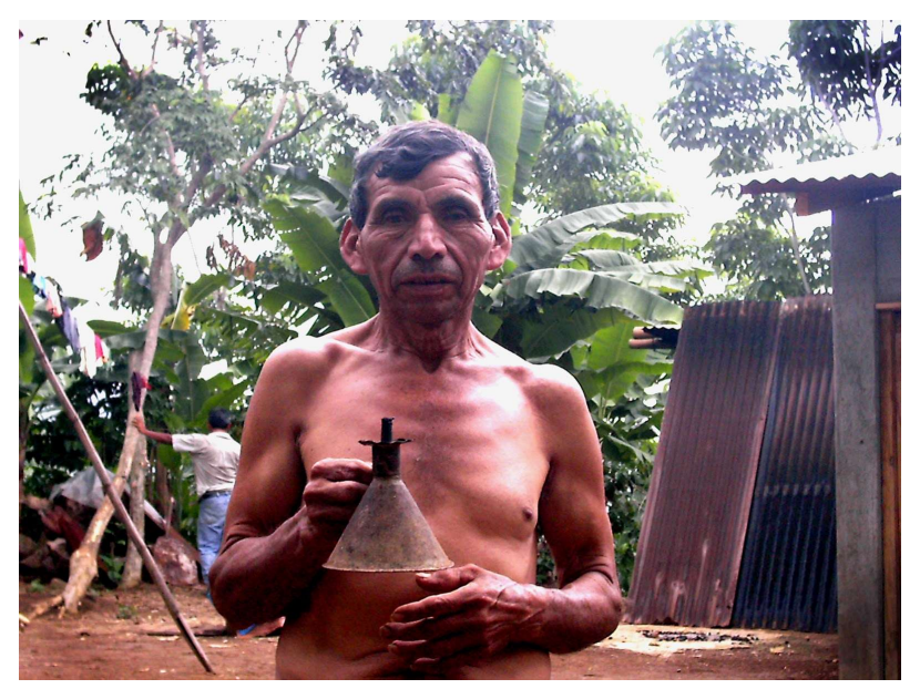
Guatemalan Man With Kerosene Lamp

Offset your carbon footprint for $10.00 per ton by helping rural Guatemalan families purchase solar home lighting systems to replace toxic and highly polluting kerosene lamps and paraffin candles. Avoid greenhouse gas emissions, help families get solar power and help local Mayan women earn a living so they can provide for their families.