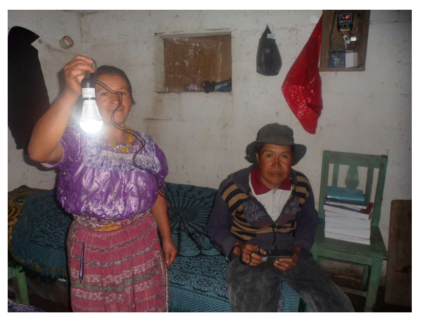
Family With First Solar Light

Every $50 we receive will offset five tons of CO2e and help one family purchase a home solar power system. But $50 is not the total cost of a lighting system. Each family will contribute to the price of their solar power system with $12.50. We take this measure in order to ensure that people value these solar power solutions, use them well and maintain them. We find that nonprofit handouts reduce the value of a product in the eyes of the recipient. Handouts are less likely to be properly maintained by recipients and more likely to be re-sold to others in exchange for cash