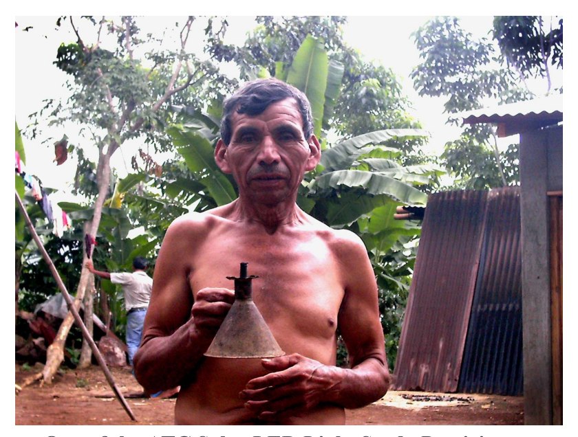
One of the ATC Solar LED Light Study Participants

When a household in rural Guatemala switches from burning candles and kerosene lamps to solar power they avoid carbon dioxide and other emissions equal to over 1 ton (2,000 pounds) of CO2e (shorthand for "carbon dioxide equivalent") per year.