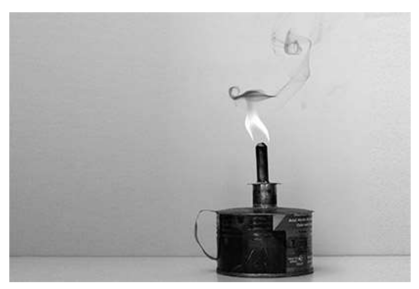
Kerosene Lamps Emit a Lot of Black Carbon Soot

Please note: The household/family that receives a solar power system will pay a portion of the cost of their system. We believe the people we serve should contribute to improve their quality of life.