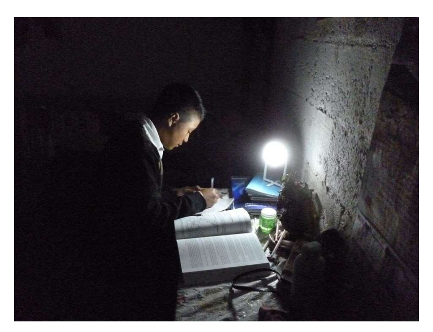
With Solar Lights Kids Study At Night For The First Time

carbon monoxide, volatile organic compounds and Black Carbon or soot. Carbon monoxide and most volatile organic compounds are toxic. Soot particles are small and hard for our lungs to expel thus soot accumulates in people's lungs, especially in the lungs of very young children and their mothers. Pulmonary disease from breathing indoor smoke is the #1 cause of death in children between the ages of 6 months to 5 years. [1]