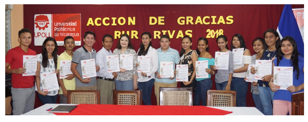
16 students took an intensive 30-hour Excel course