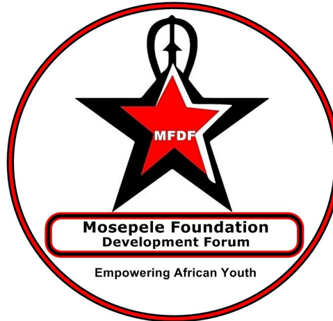
MOSEPELE FOUNDATION DEVELOPEMNT FORUM

To beckon the youth of Lesotho into the center stage of the economic revolution waged with the aim of salvaging, attracting and retaining the little that is left of the pillaged human capital of Lesotho.