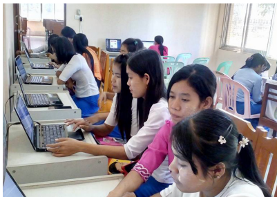
Students at Dawei University using the new eTekkatho Digital Library.