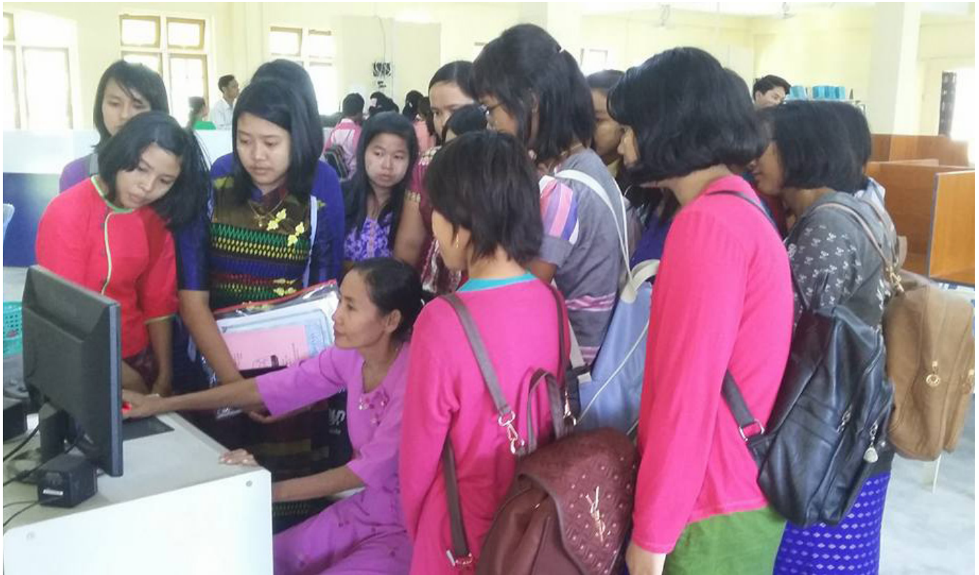
Students learning to use eTekkatho at Taungoo University