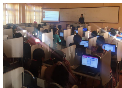
New eTekkatho installation at Taunggok Degree College