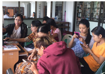
Hpa-An University students learning to use their new eTekkatho library on desktop and mobile devices.