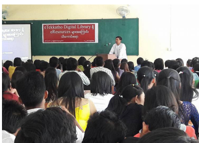
eTekkatho training course at Bago University.