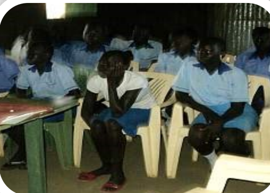
Pupils listening during adolescence awareness session conducted by IDO