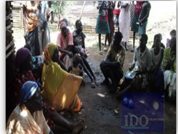
Women and girls empowerment through community dialogue forums