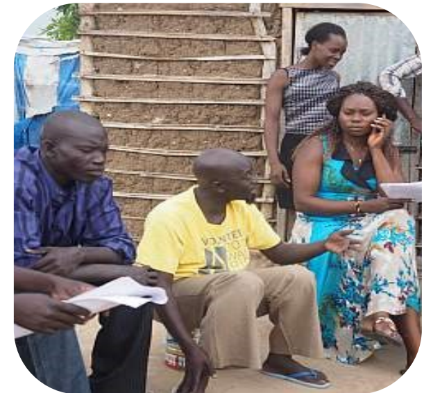
IDO volunteers on awareness creation on peaceful dispute resolution