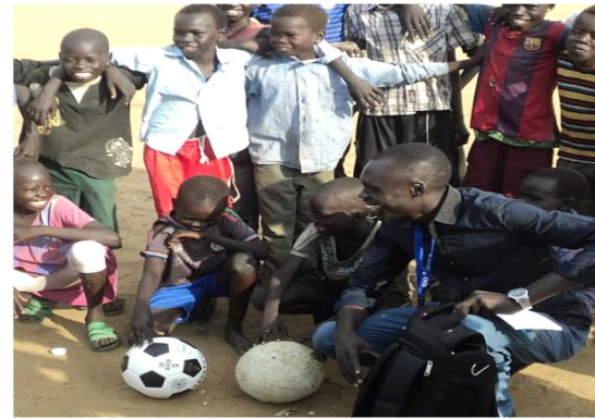
Happy street children after receiving new footballs from IDO