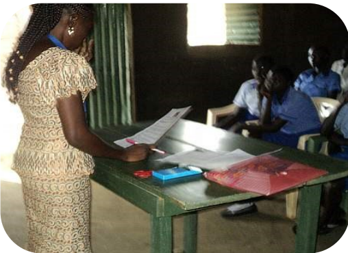
IDO's Education officer during sensitization

Achieve resilience by enhancing active participation of community members in developmental and community service programs.