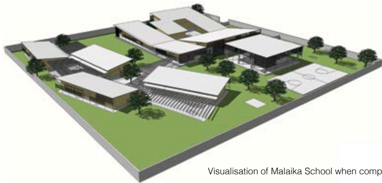
Visualisation of Malaika School when completed

The construction of the Malaika School has provided much needed employment for the community. In line with our philosophy of gender equality, we have recruited women to join the construction team, providing them with training and an income to help support them and their families. We have also brought together a team of local women to learn how to sew uniforms for our girls, which not only provides them with a new skill, but also helps involve the community with the school. The parents of both current and future students are not only involved in the building of the school, but also take care of its maintenance. Under the guidance of our maintenance supervisor, they help with the upkeep of the school by managing the kitchen and cooking meals, cleaning the school and providing security.