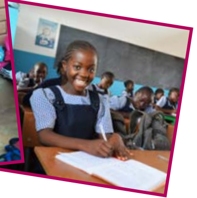
Eve inaugurating the school library