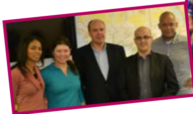
Our volunteer executive team

Malaika provides the tools and opportunities for individuals to have a lasting impact on the future of the DRC. We offer community-driven health, education and infrastructure programs.