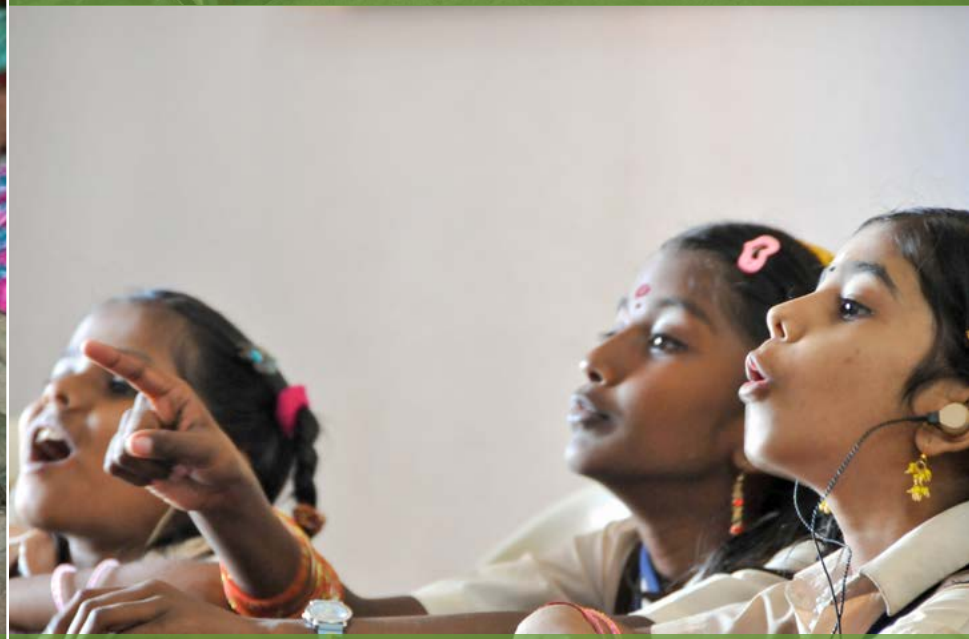
Speech for hearing-impaired children