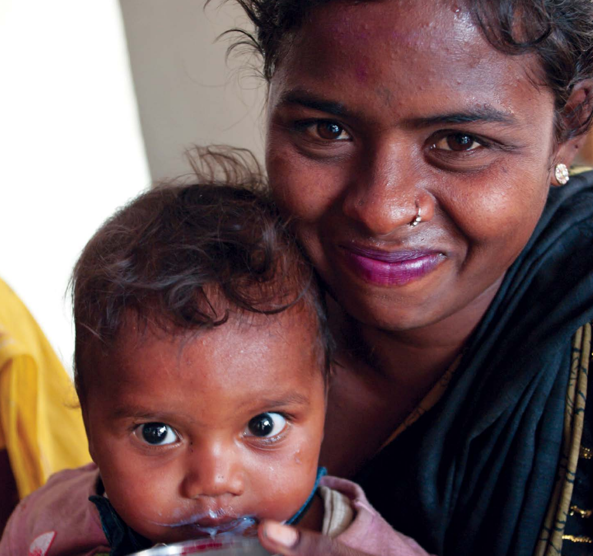
INDIA - feeding 10 million people every year, especially in tribal areas