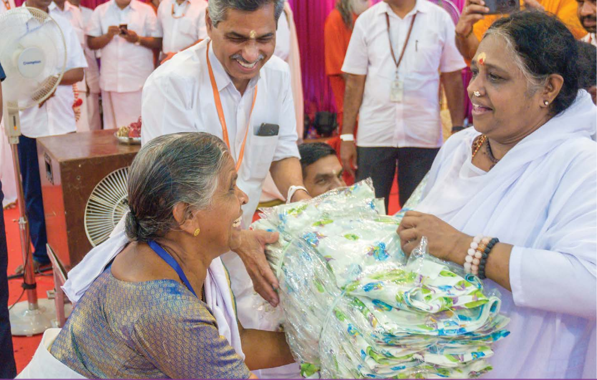
On her 65th birthday, Amma donated 400,000 saris to women in need.