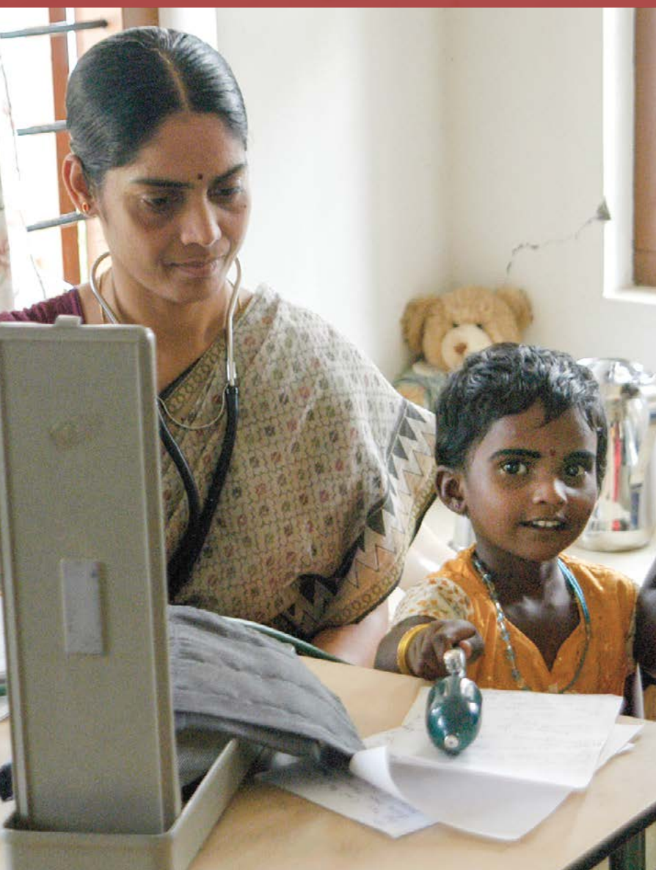
Pediatrics emphasizes prevention