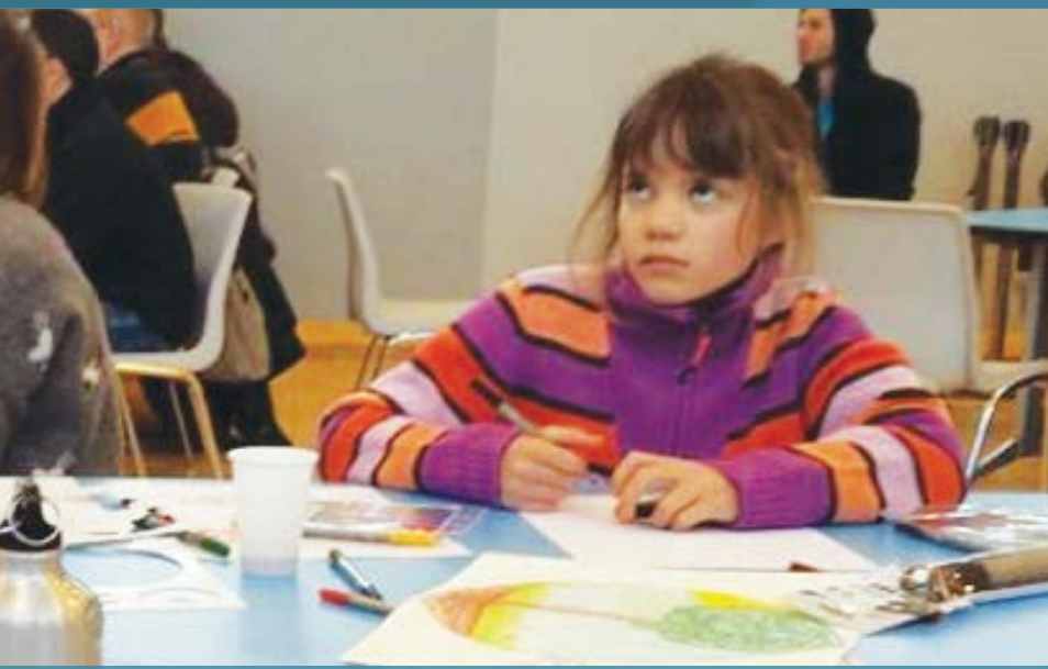
Supporting refugees in Denmark