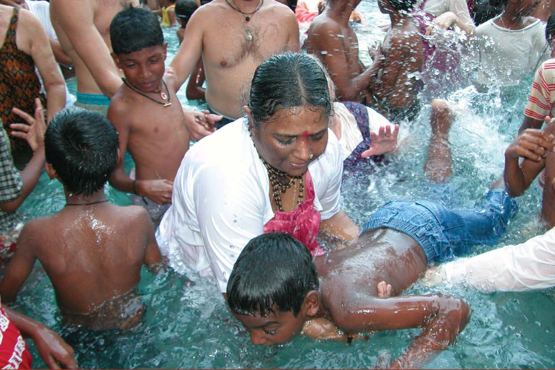
Amma started swimming lessons for village children after the 2004 tsunami.