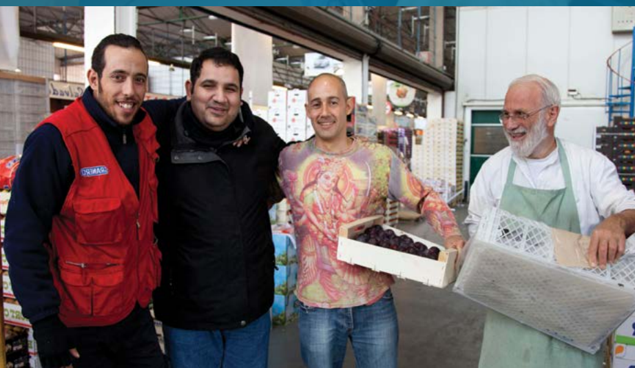
SPAIN - delivering food to homes