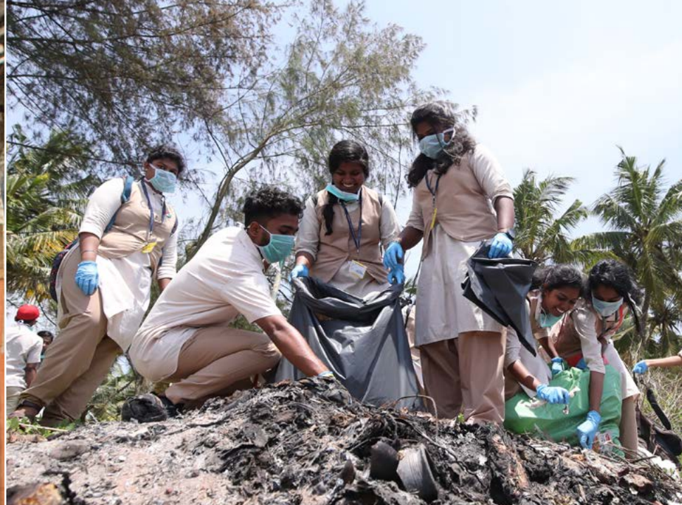
Cleaning up public trash