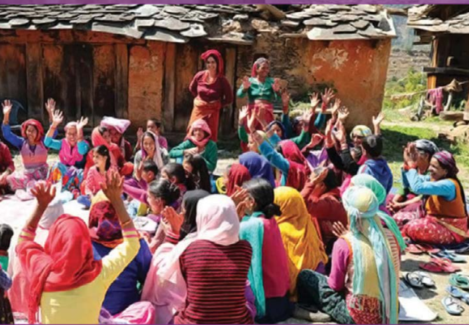
Village self help group meeting