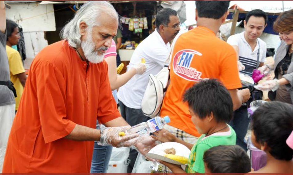
Typhoon in the Philippines, 2013