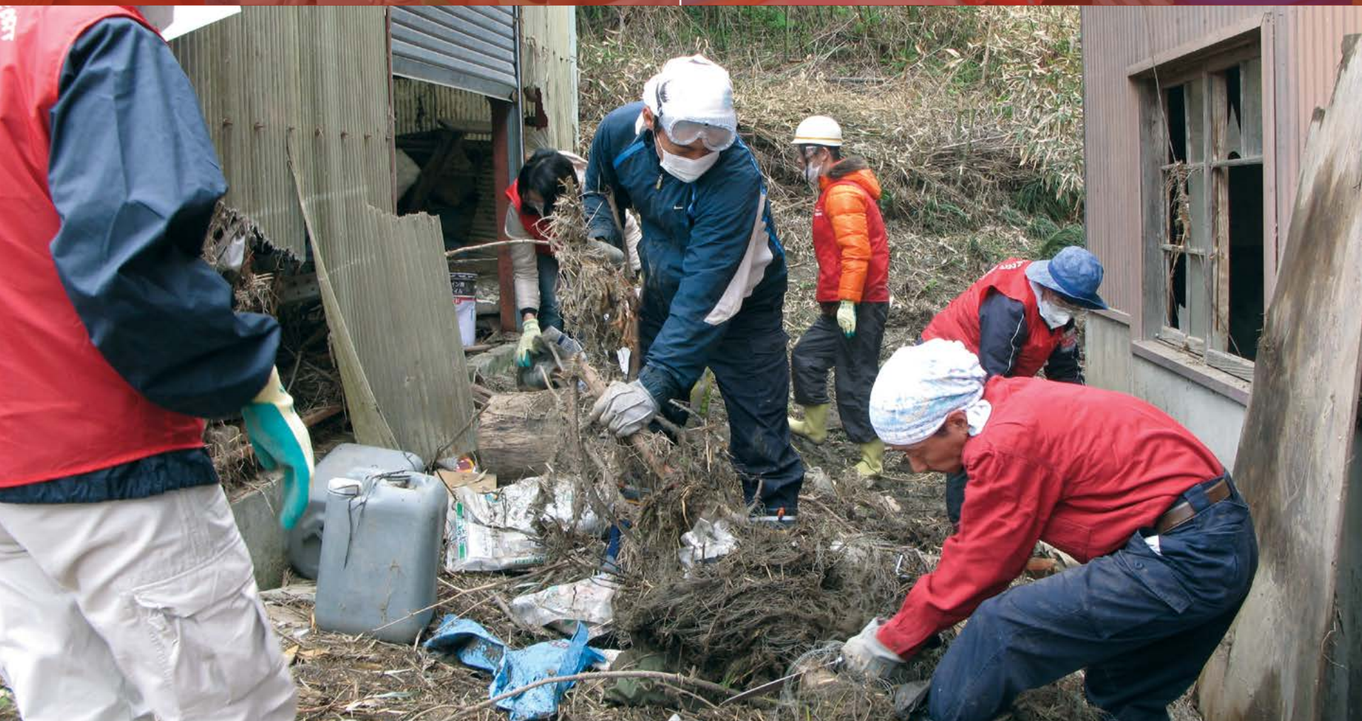
Post-disaster cleanup in a remote town in Japan after the 2011 tsunami