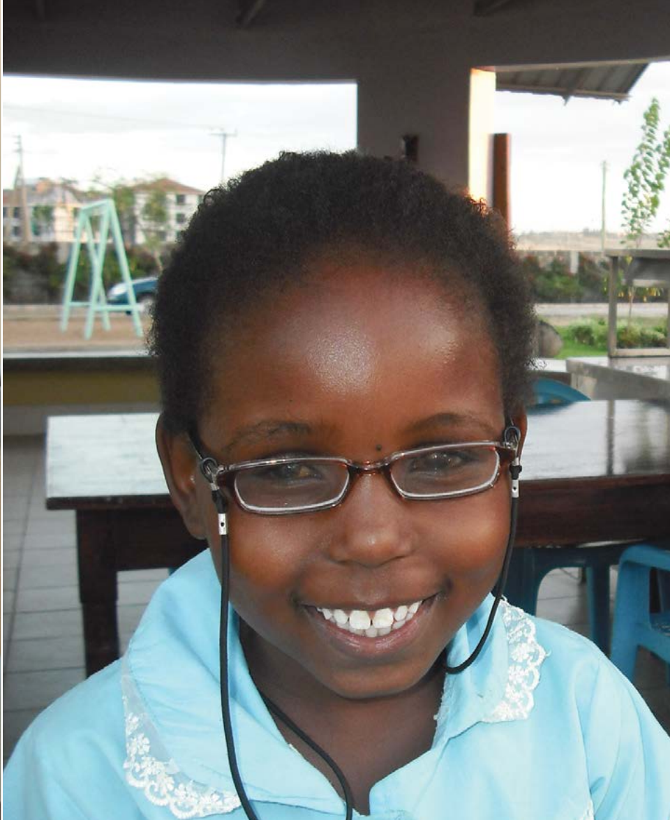
Eyesight restored for this girl in Kenya