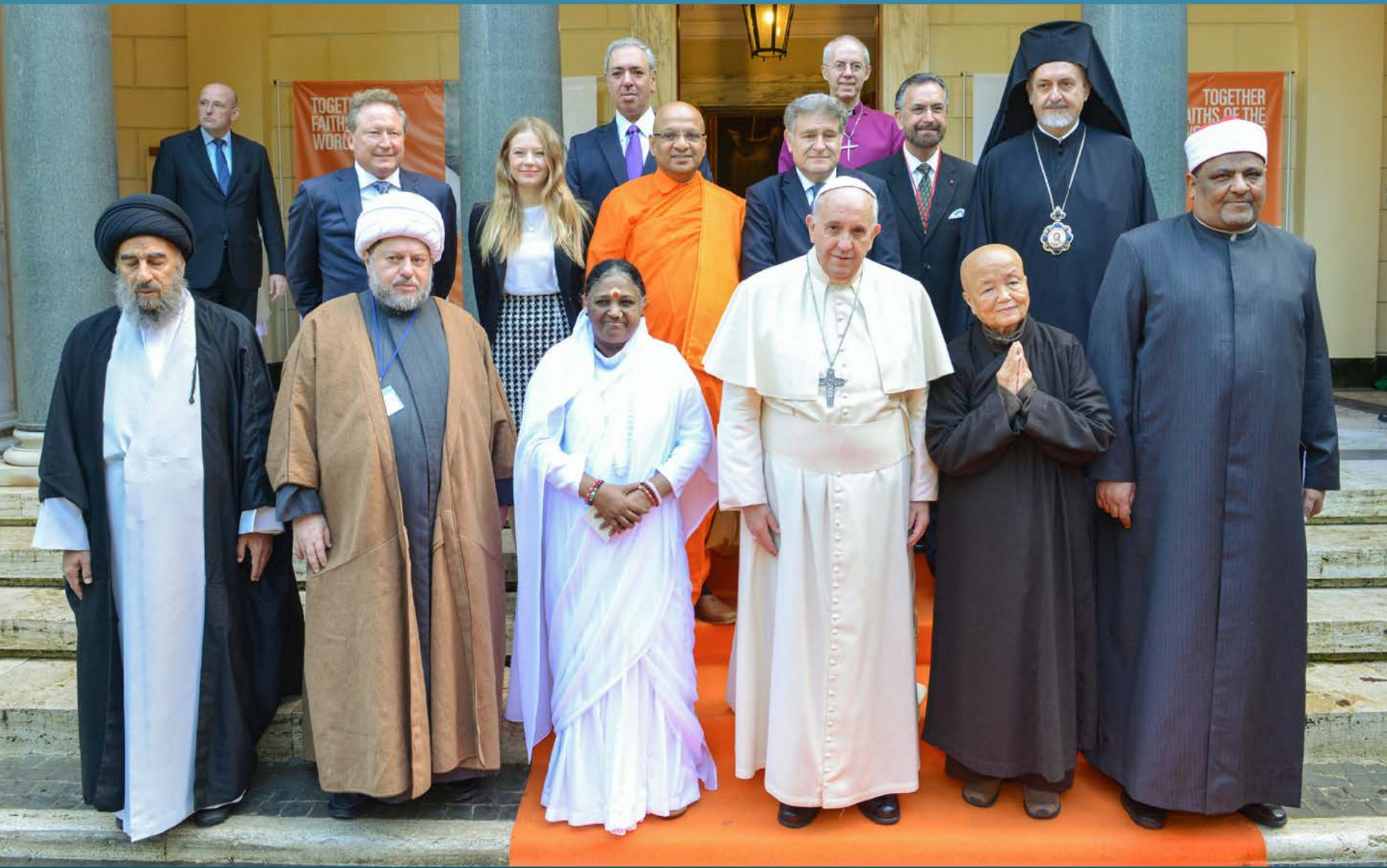
2014 - Faith Leaders' Declaration Against Slavery at the Vatican

Amma has never asked anyone to change their religion, but only to go deeper into their own faith and live by its essential principles.