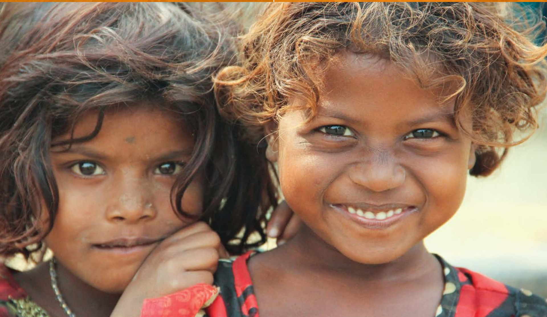
In Bihar, working to bring scheduled-caste Musahar people out of abject poverty