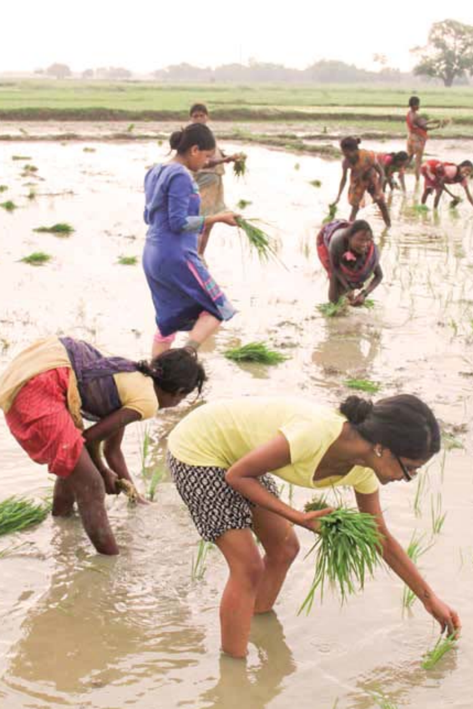
Student internships in villages