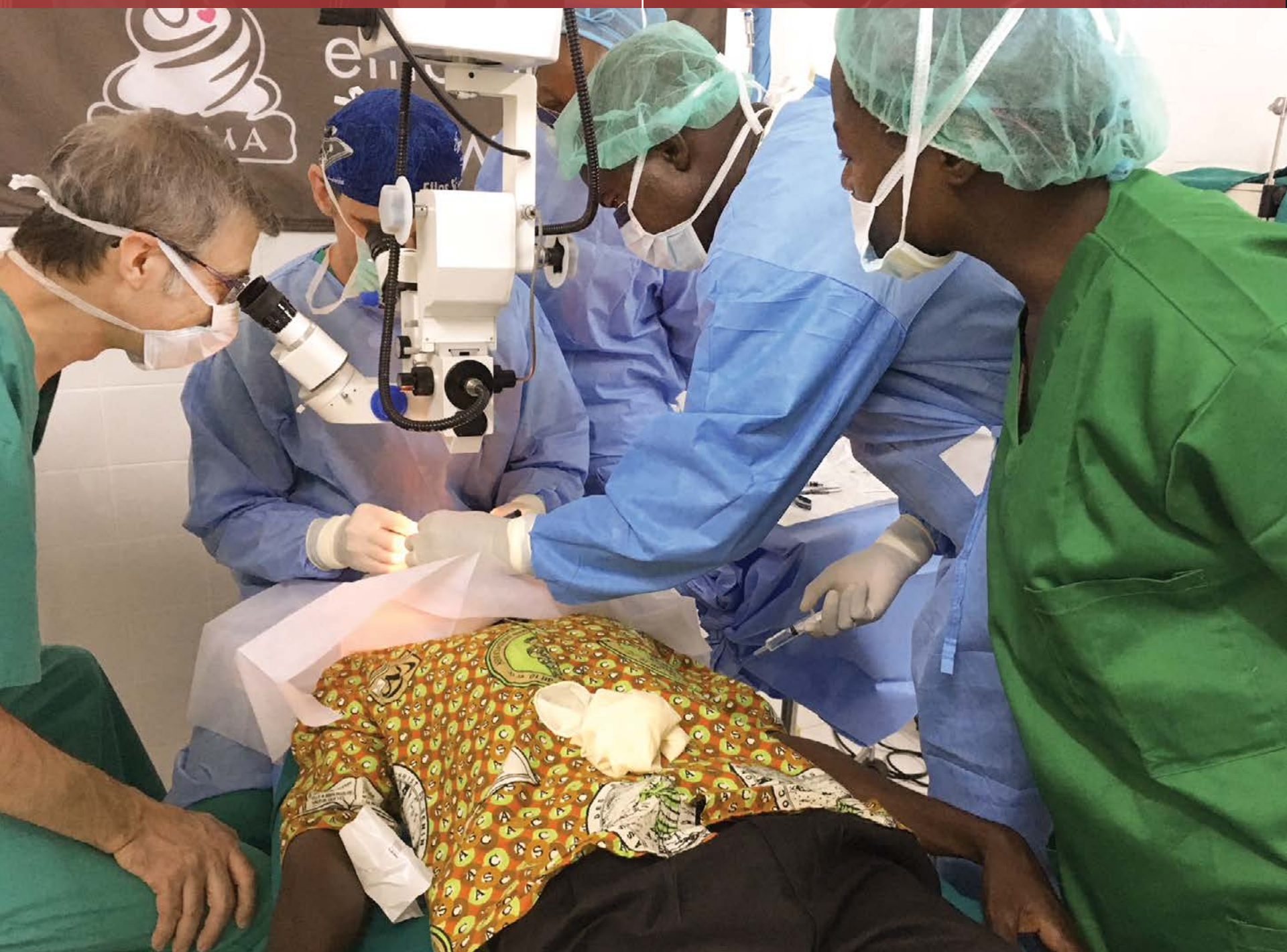
The team from Spain works with local doctors and students in Africa.