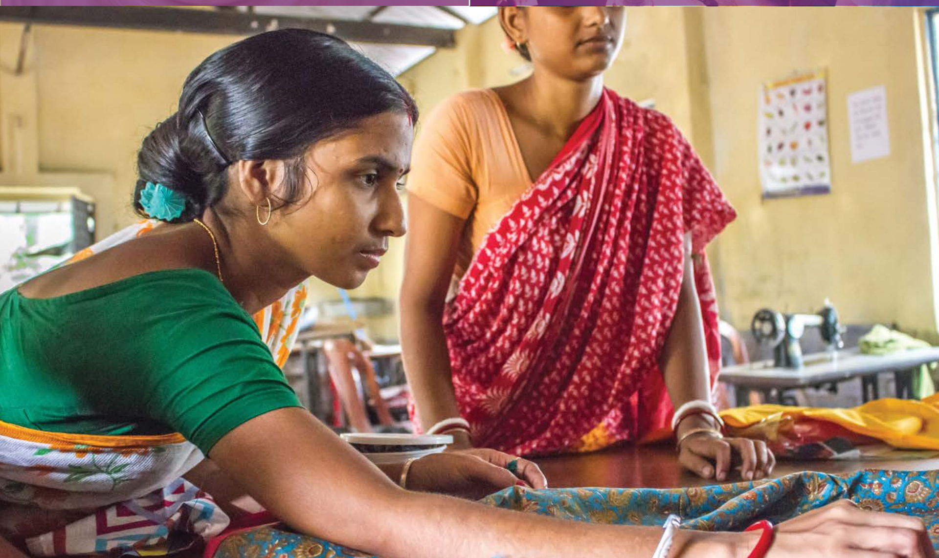
Women in rural India learn tailoring to earn extra income for their families.