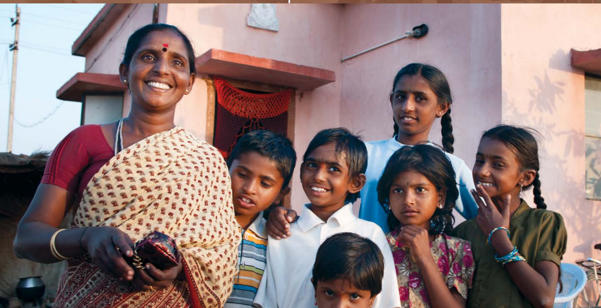
We built 1000 new homes in Raichur, Karnataka after floods in 2015.