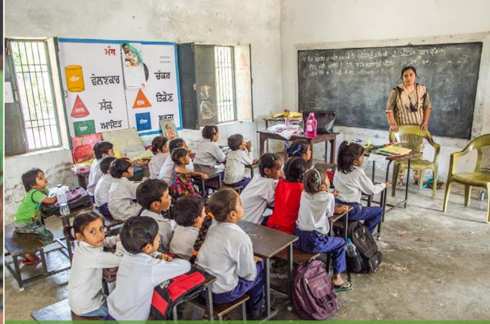
Encouraging school attendance in villages across India