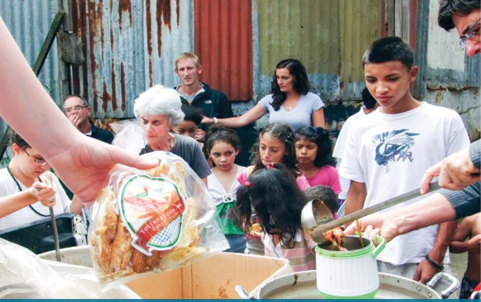
COSTA RICA - food for families