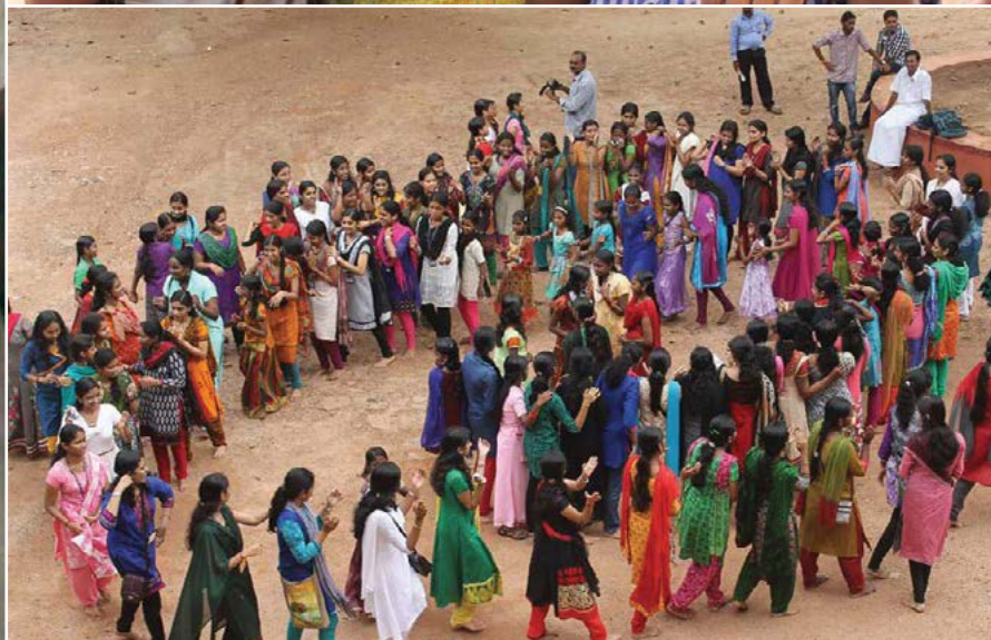
Children at our Kerala orphanage win awards in music, sports and dance.