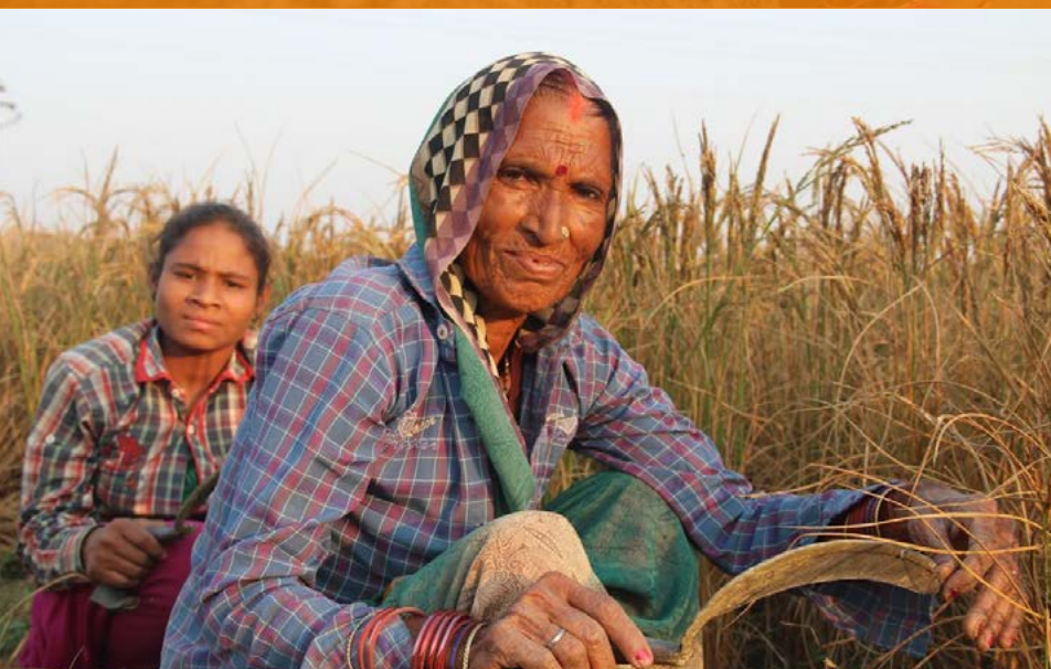
Farmers' groups run collectively