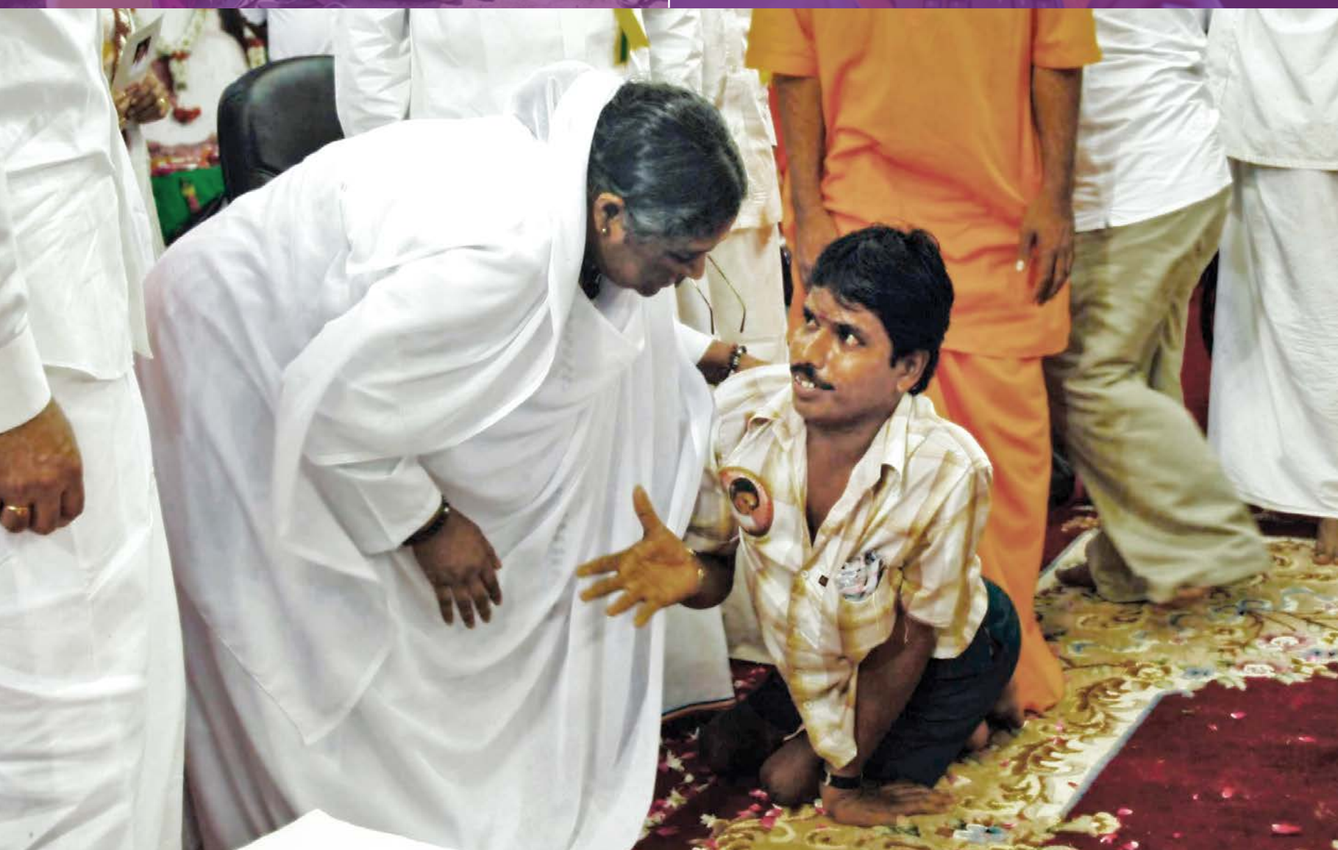
A man with disabilities thanks Amma for lifetime financial aid.