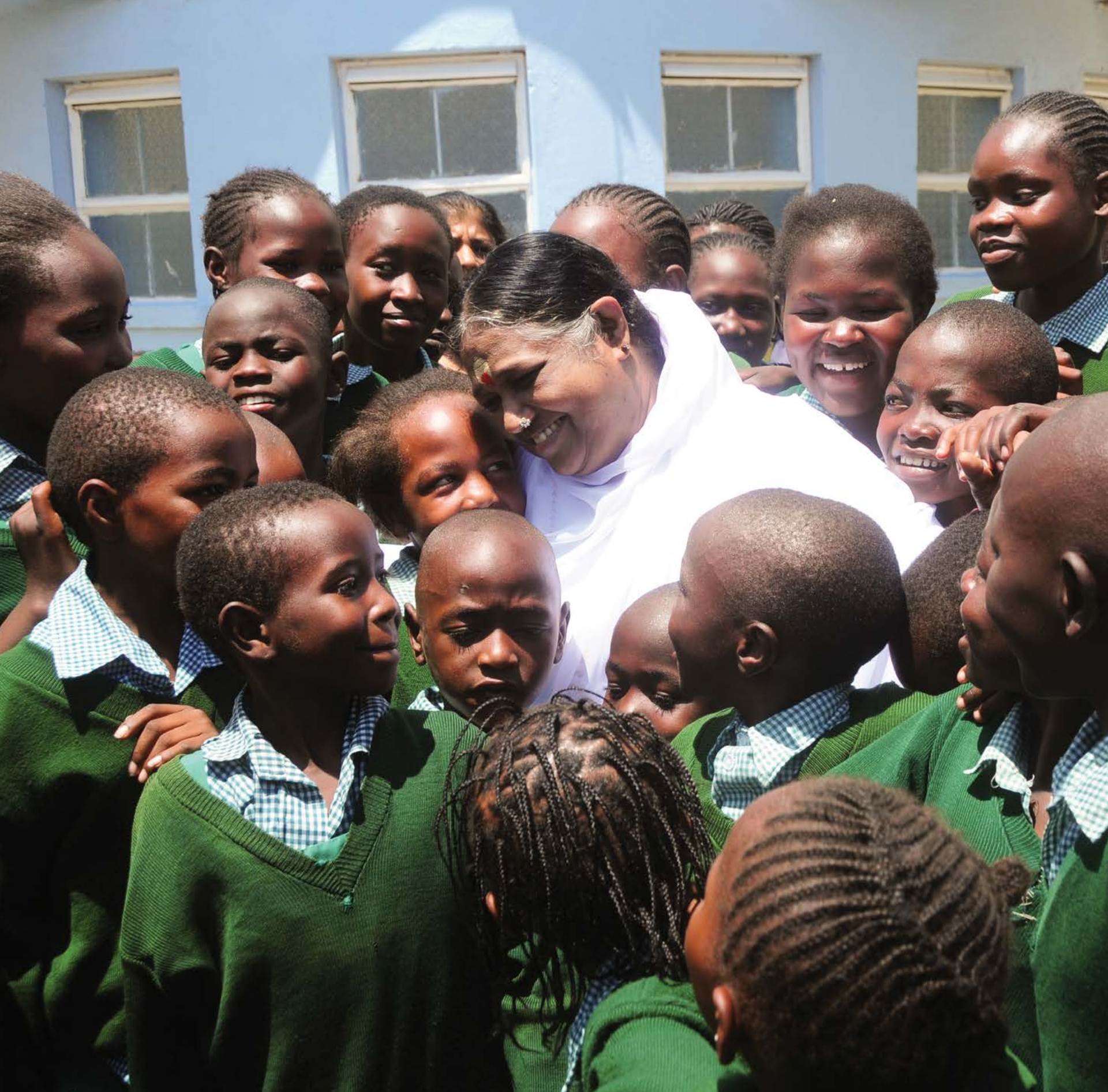
A children's community center and day school in Nairobi, Kenya