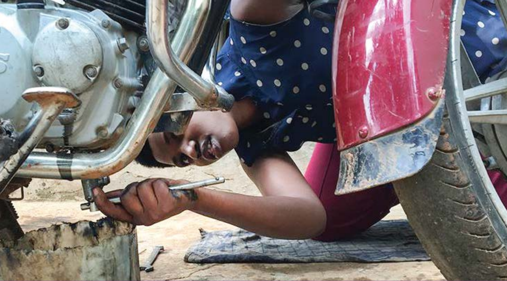
People in Rwanda studied motorcycle repair for a new way to earn.