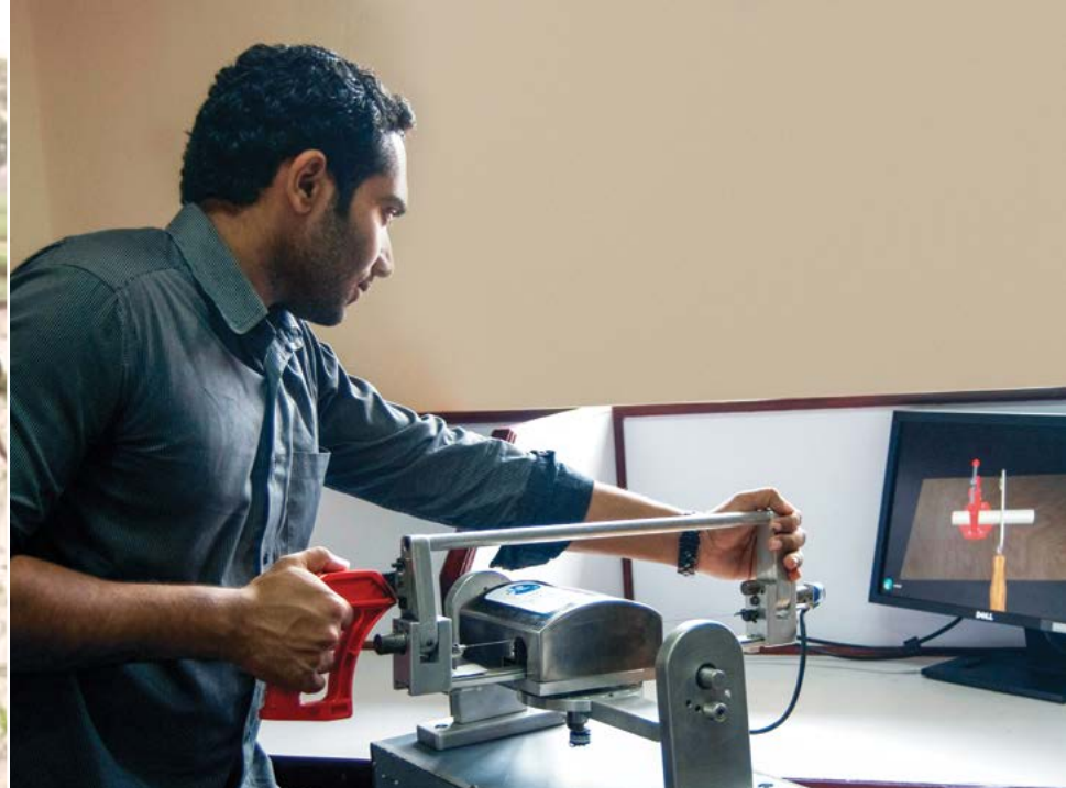
Ranked 8th best university in India