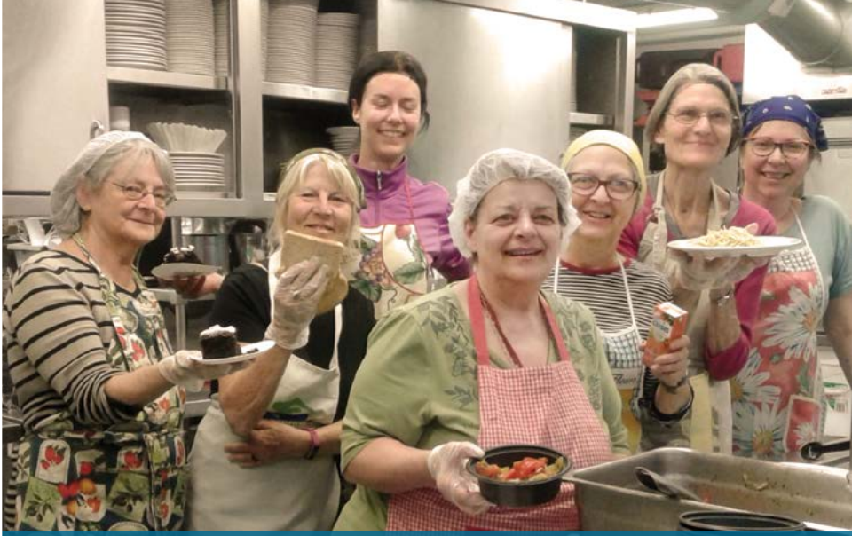
CANADA - meals for the homeless