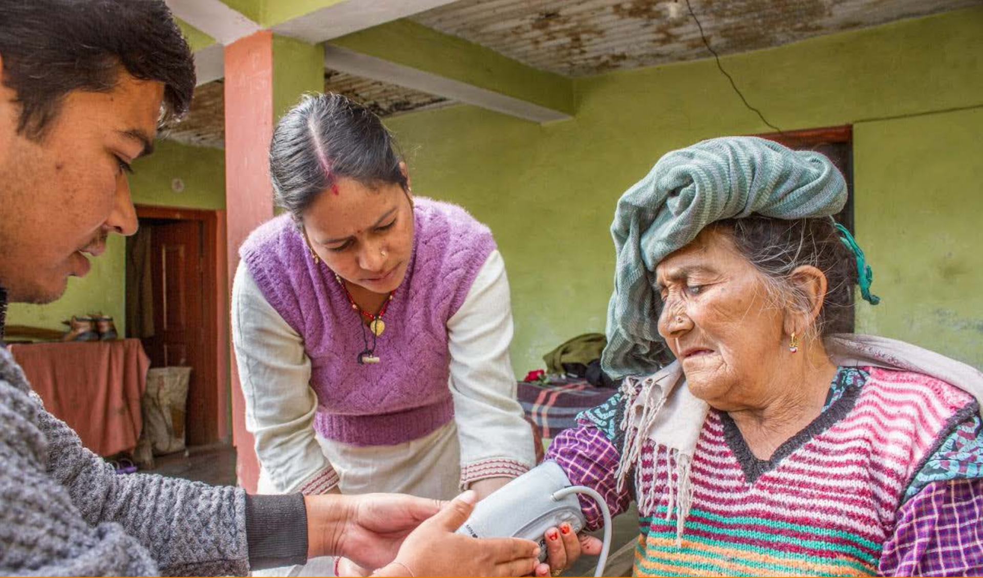
Health workers are assigned to provide basic treatment in remote areas and connect villagers with the nearest hospitals and health care centers.