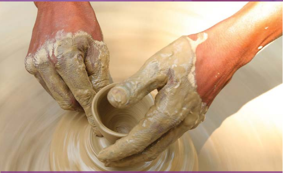
Reviving the tradition of claywork