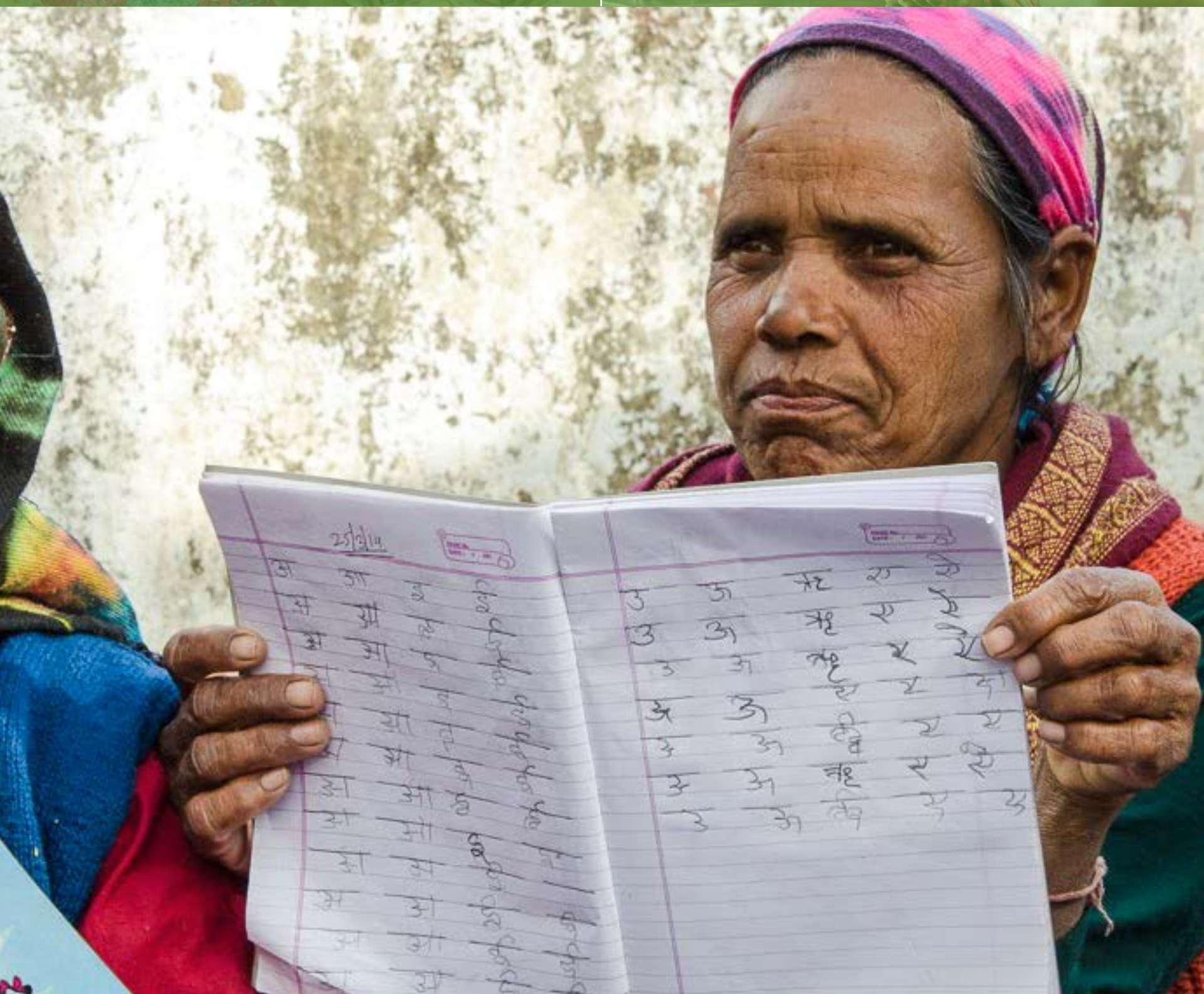
In 2008, we won a UNESCO Award for our adult education program.