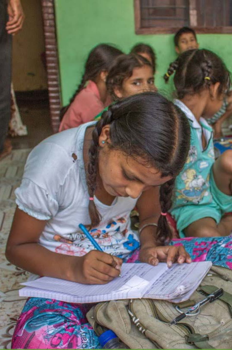
Supporting education for girls