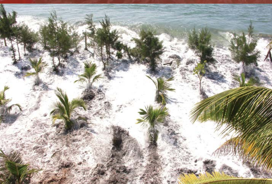
Tsunami hitting the Amritapuri area