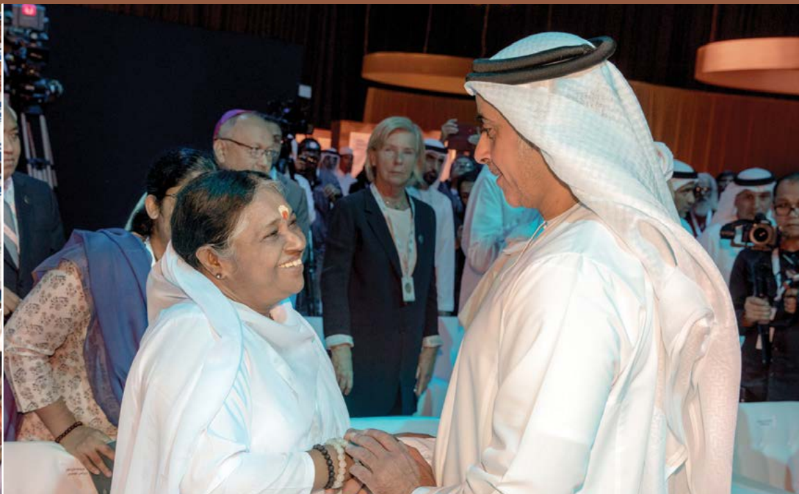
2018 - Interfaith Summit to Protect Children Online, Abu Dhabi