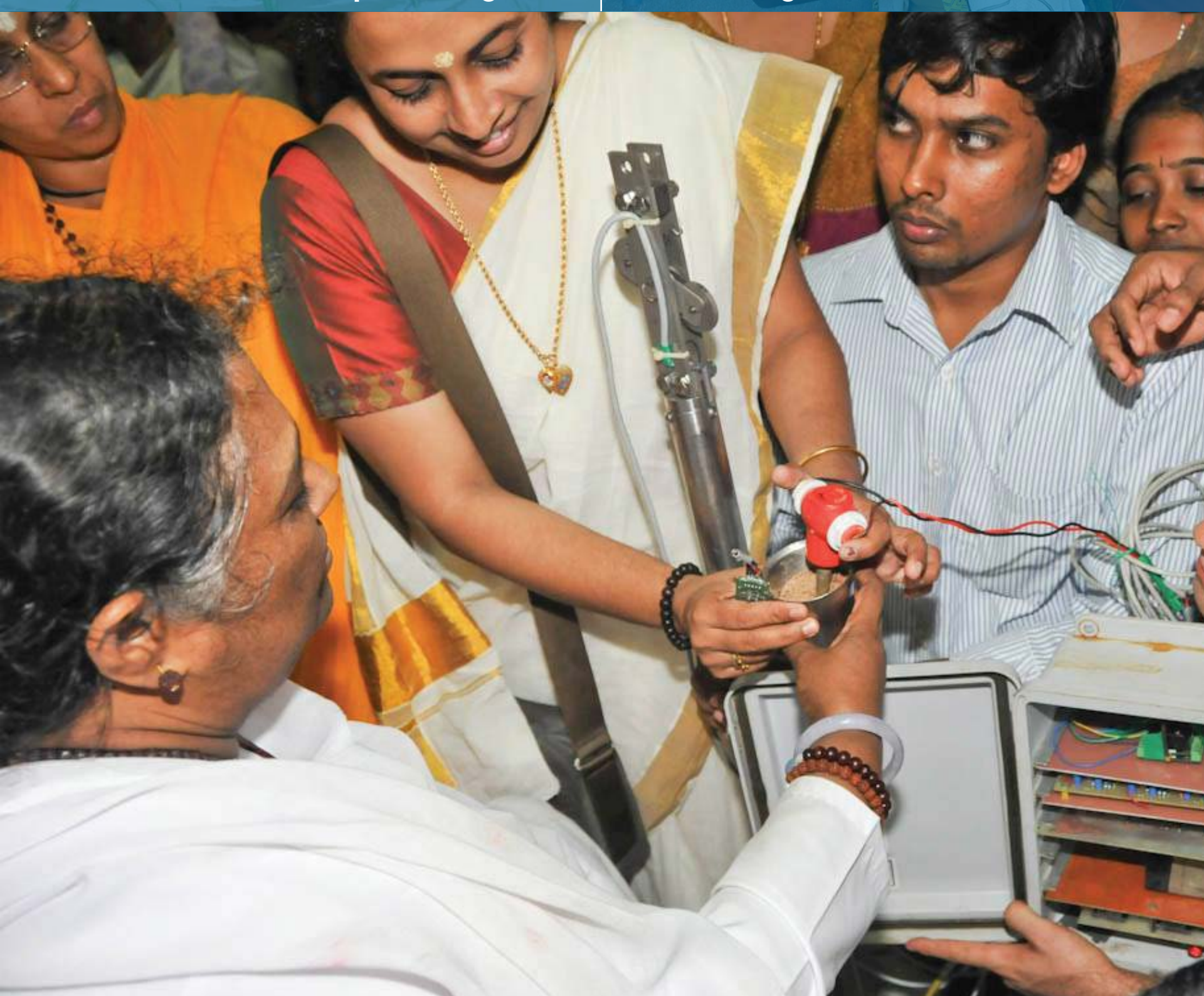
Wireless landslide detectors installed for remote areas in Sikkim