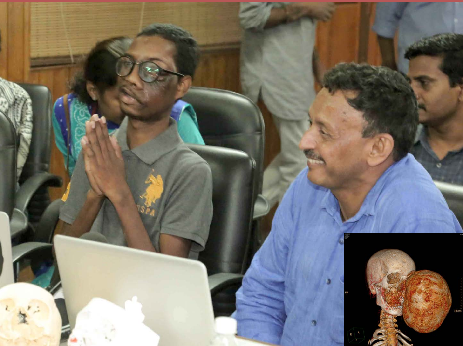
Surgeons removed a football-sized tumor from the jaw of a poor, young tribal man from Jharkhand, India. The procedure was free-of-cost.