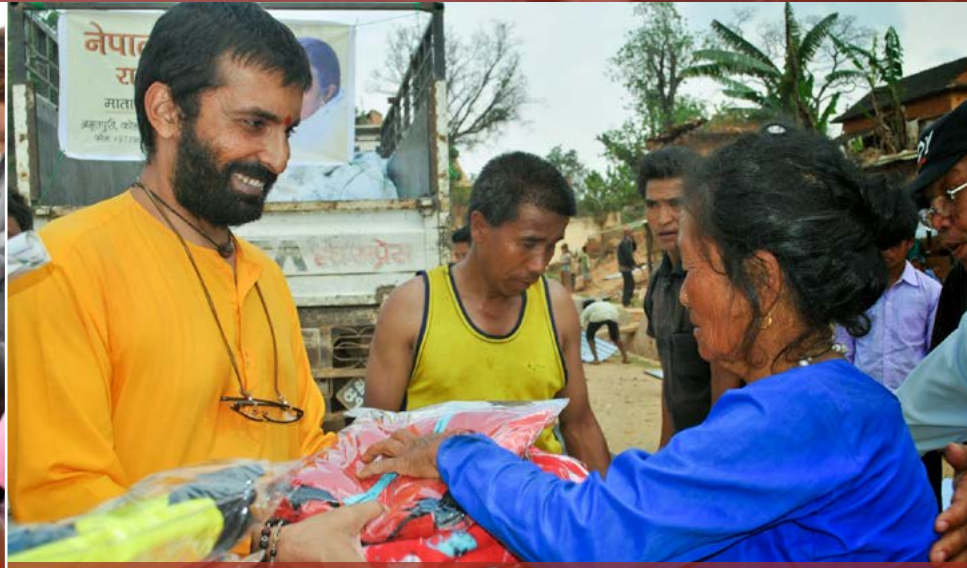
Earthquake in Nepal, 2015