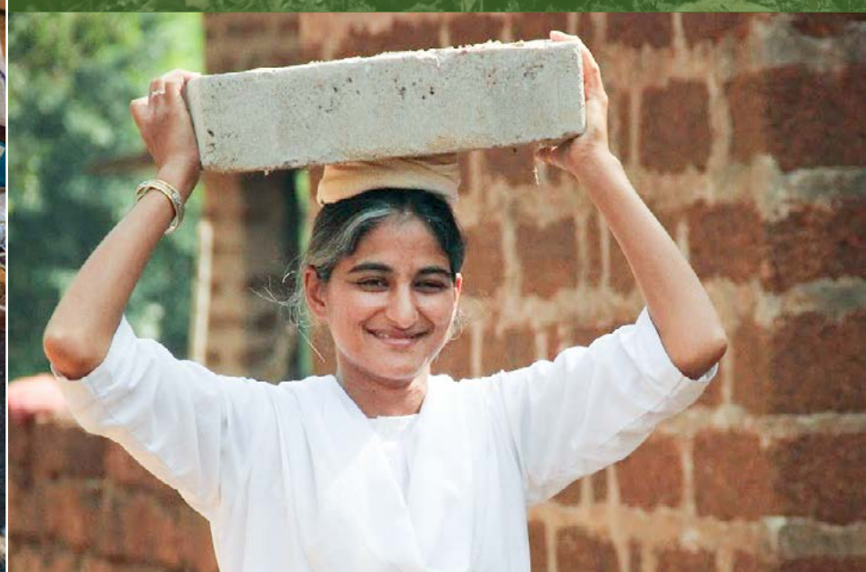
Building toilets to end open defecation