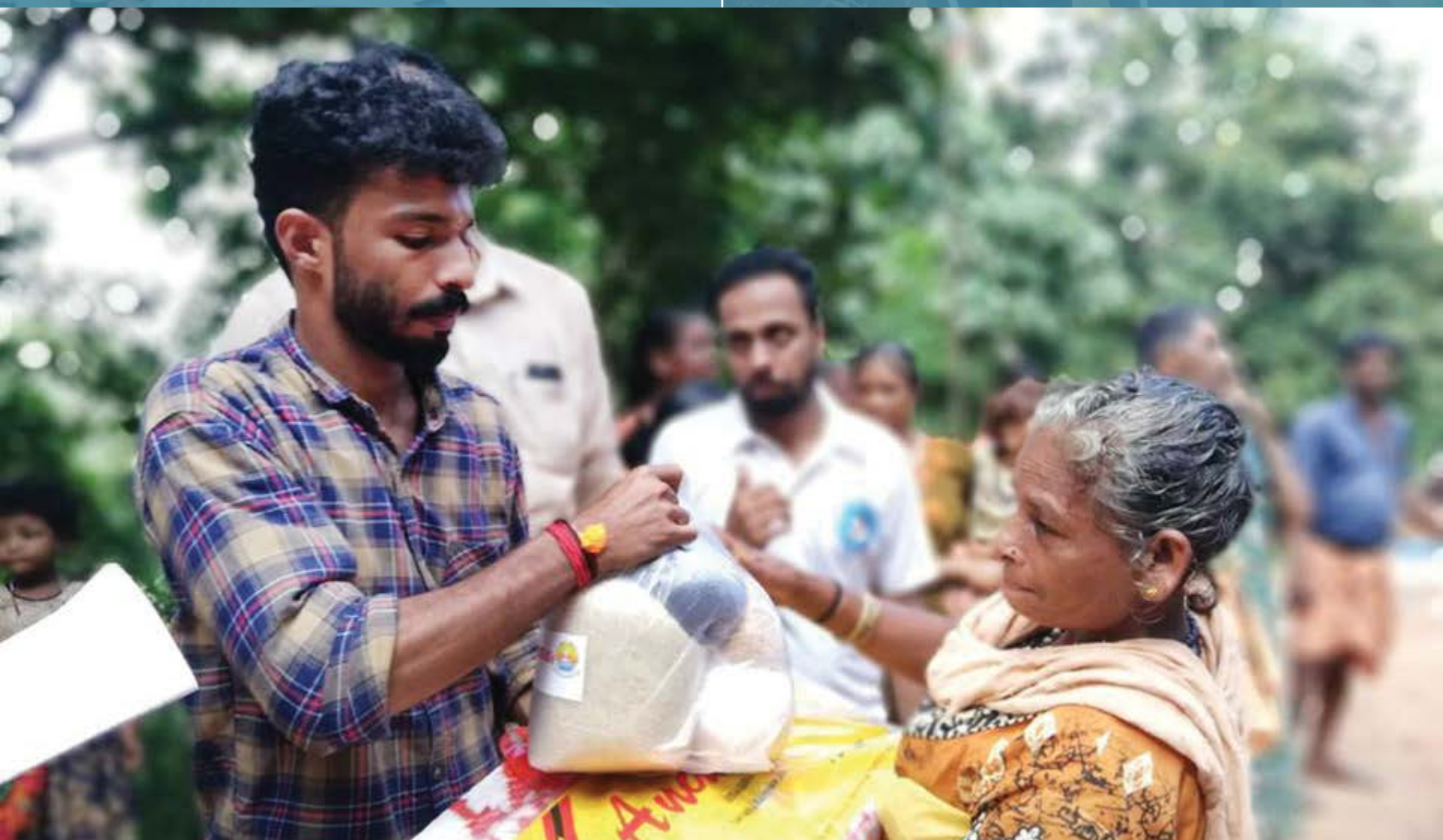
AYUDH volunteers worked in relief camps in the 2018 Kerala floods.