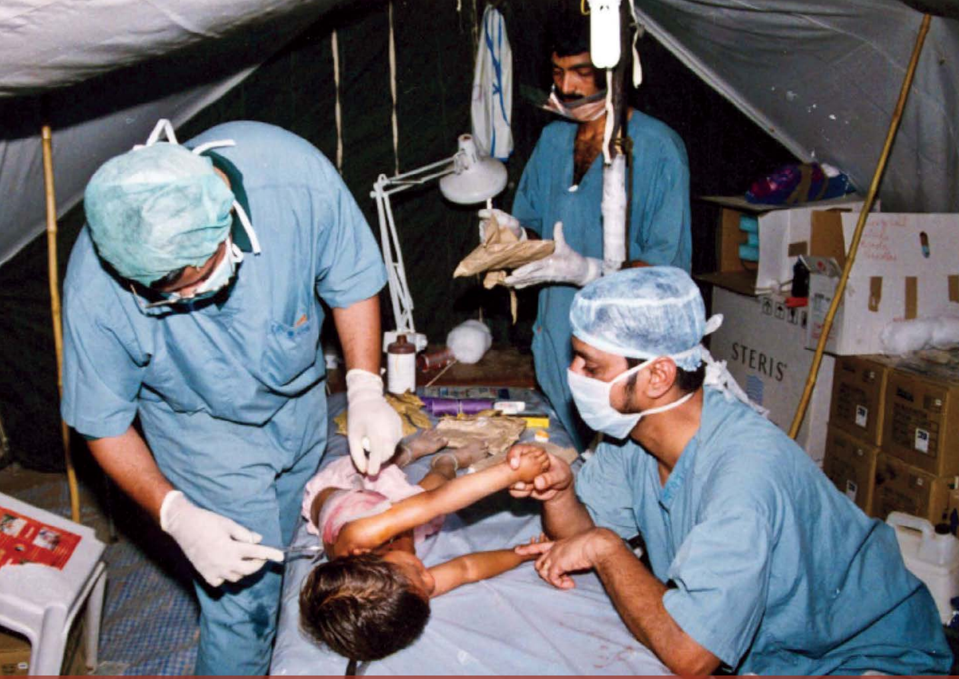
First response medical teams rushed to Gujarat after the 2001 earthquake.