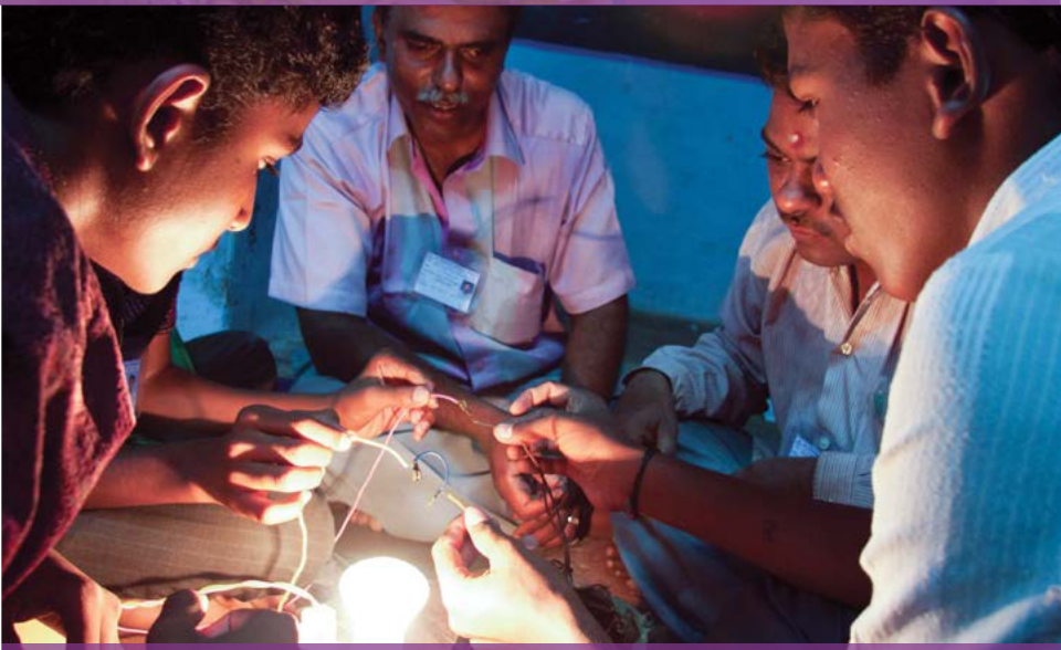
11 trades taught in industrial training