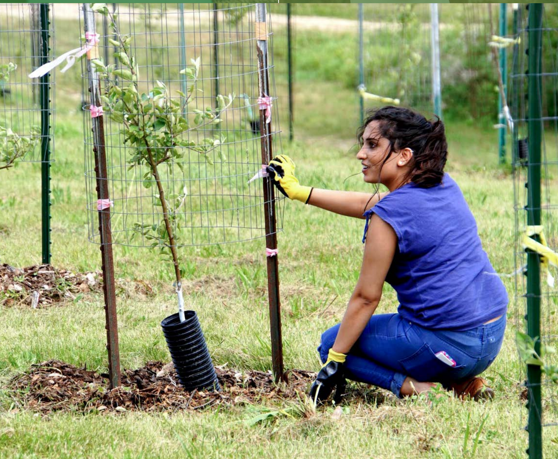
Our volunteers have planted more than one million trees around the world.