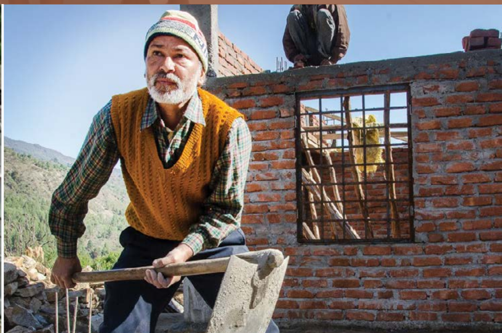
Building homes in Uttarakhand