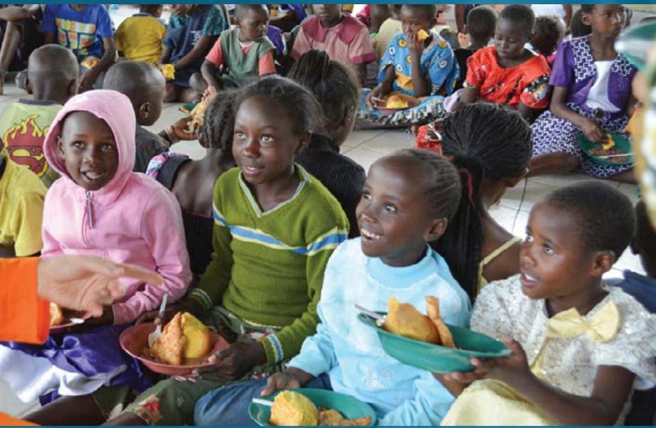
KENYA - meals at school