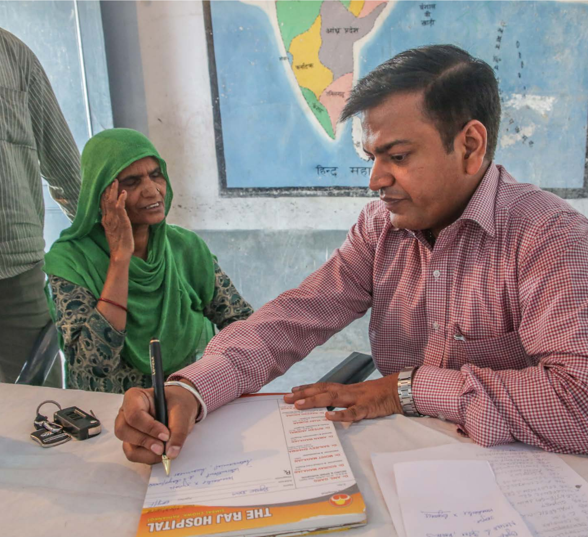
More than 100 health camps are held throughout rural India every year