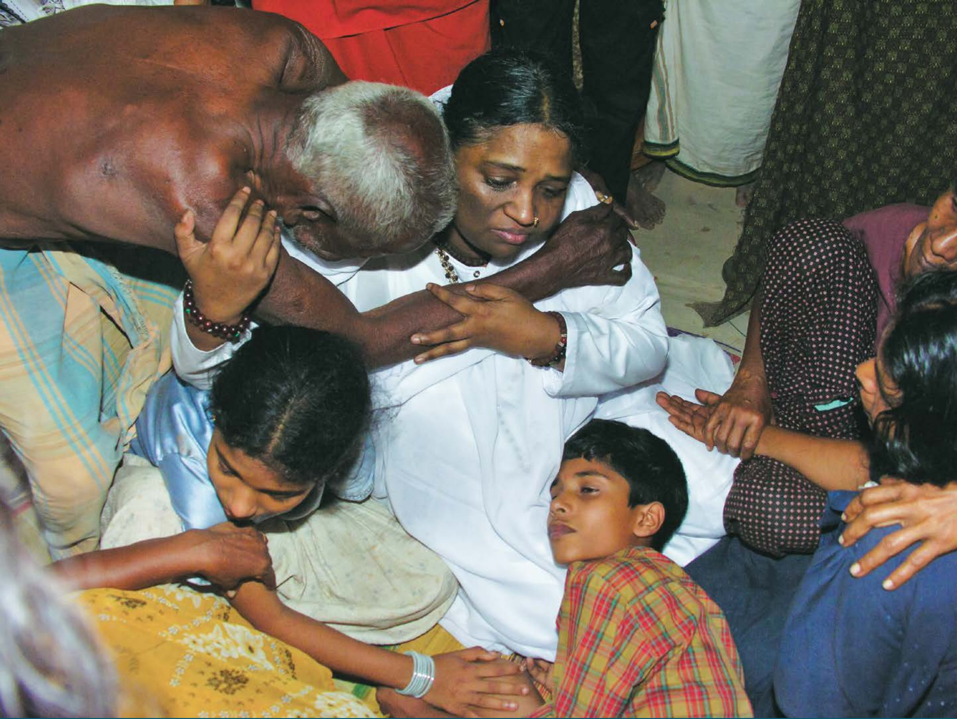
2005 - In Kollam District, Kerala after the Indian Ocean Tsunami