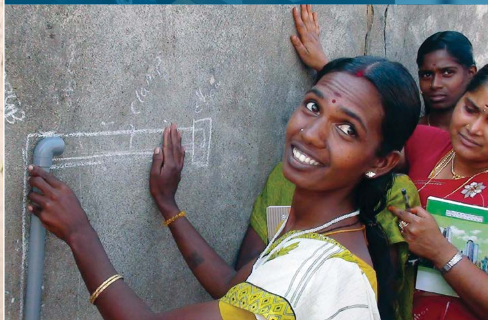
Skills training centers for trade work