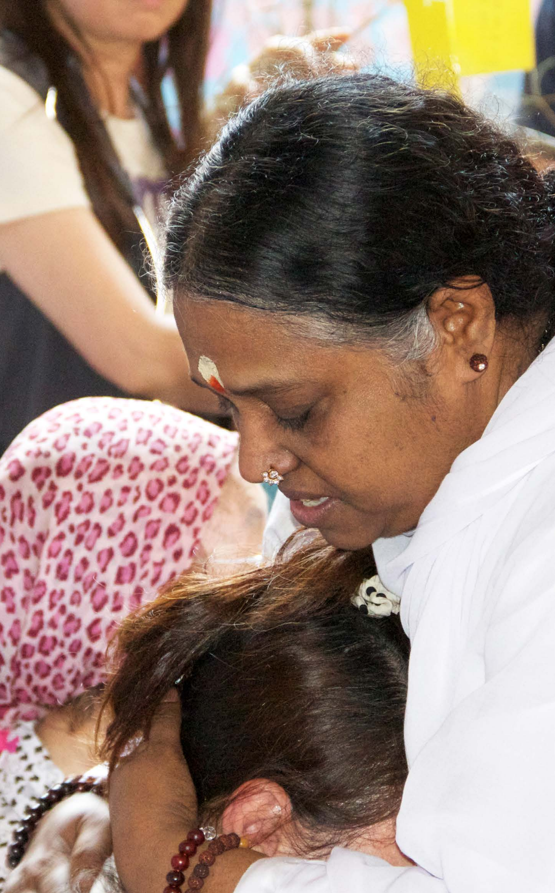
Many people in Japan came to Amma for solace after the 2011 tsunami.