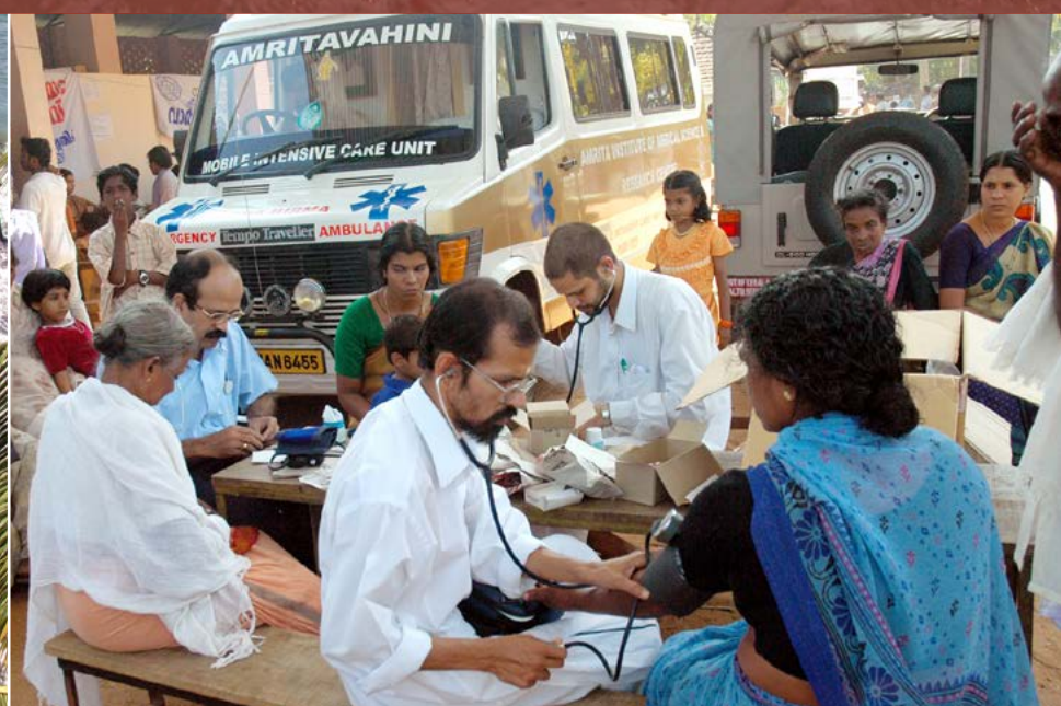
Medical camp for tsunami survivors