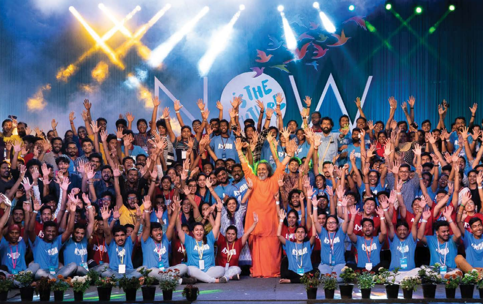
In 2018, 1200 youth from across India took part in a leadership summit.