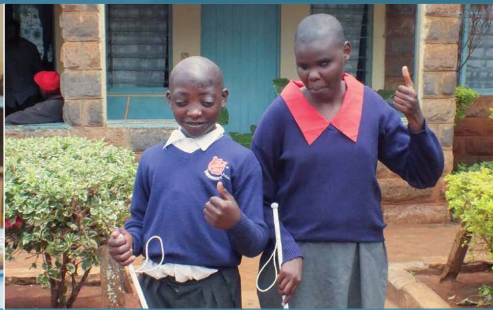
Canes to blind children in Kenya