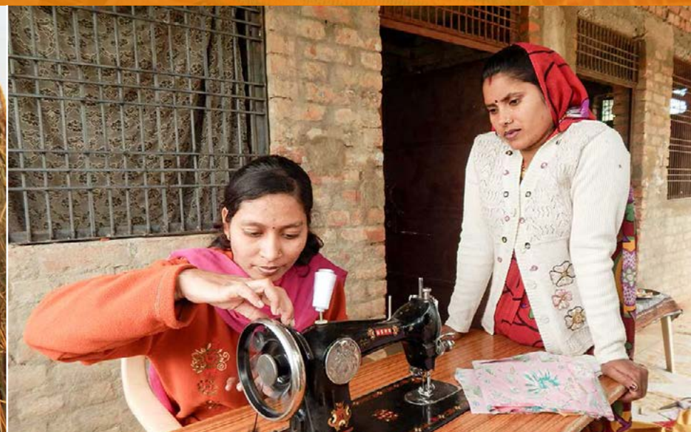
Making reusable banana fiber pads