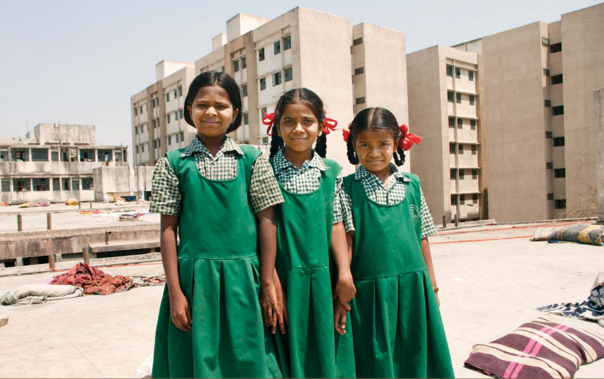
These girls and their families now live in apartments we built in Pune, Maharashtra for people who used to live in the city's slums.