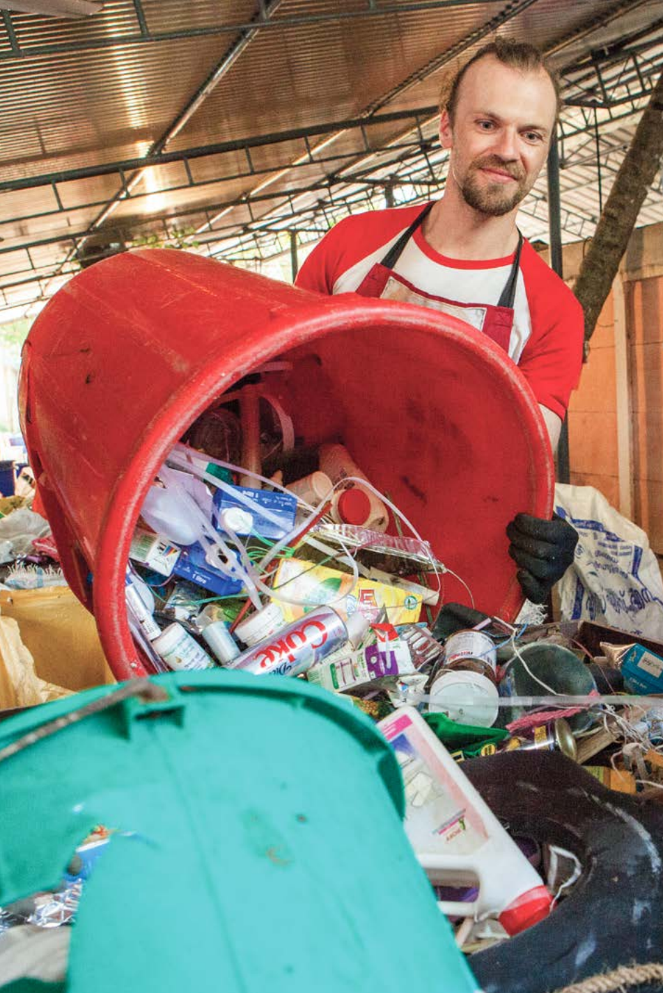
Waste Management in practice