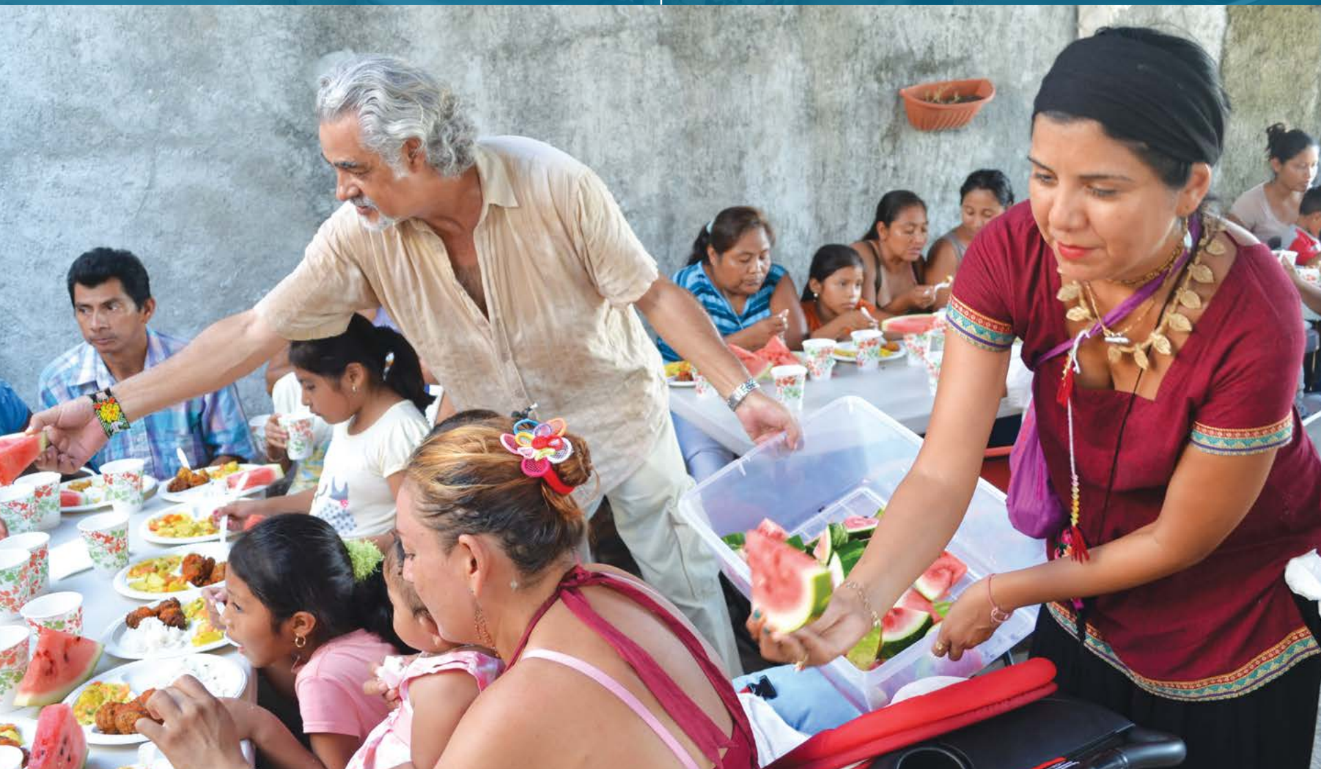
MEXICO - volunteers built and operate a kitchen to serve the poor