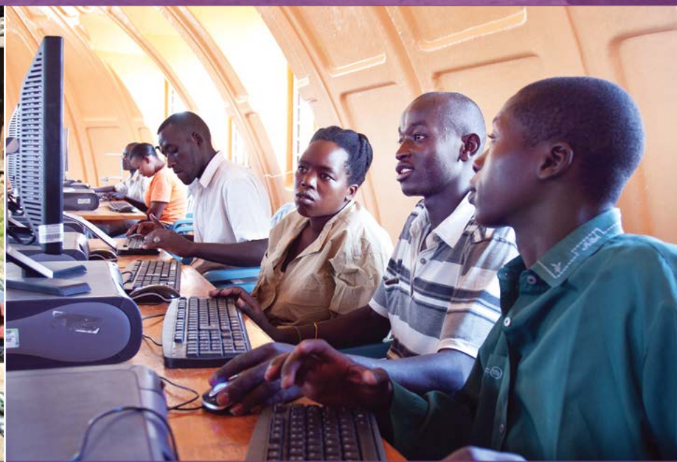
Skills training center in Kenya