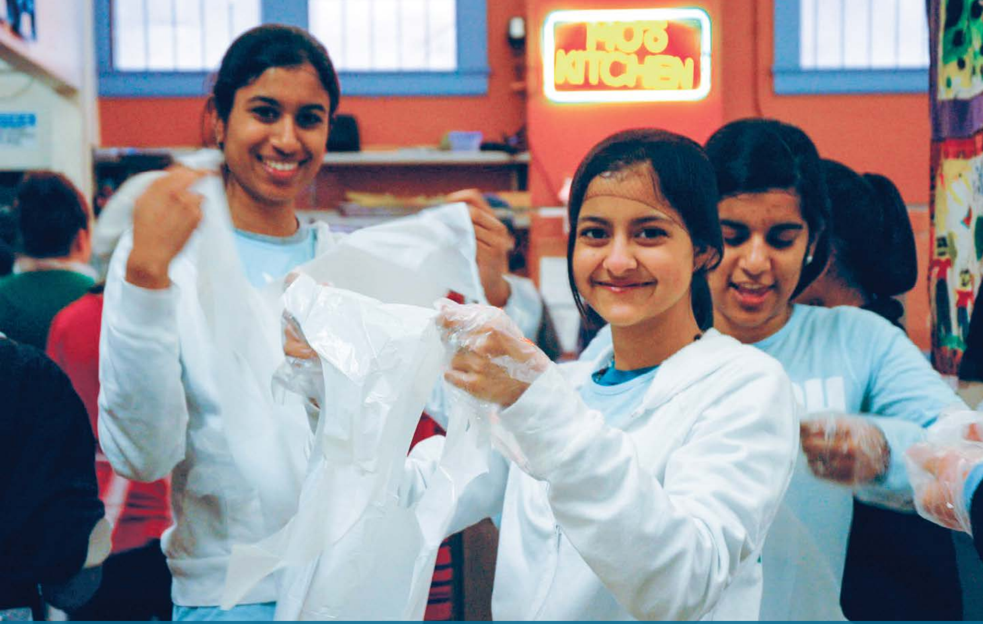
US - serving food to more than 150,000 people across the country