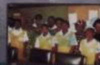
OVCs from Adolphus Ojo State School