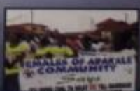
Community rally performing the ABC message