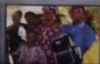
Some OVCs and their caregivers