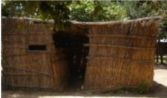
This is the grass-thatched hut that was recently used as a makeshift office for teachers at Chimvite School

When CRIDOC staff visited the school on 21 November 2009 as part of their routine advocacy work, it had a makeshift office for the Head Teacher with grass thatched roof and walls also made of grass and tree planks and without any doors. Basically, what the situation means is that no single educational materials were kept in this makeshift office as there was no security.