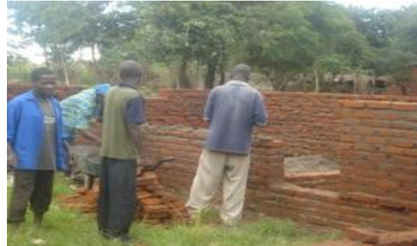
The progress of the construction work has been quite impressive due to active community involvement

Although the USAID provided us with funds to purchase construction of building materials through the contract that was signed on 2 nd December 2010, there