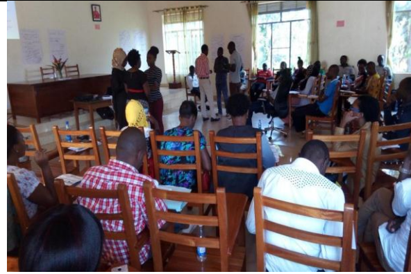
Youth participate in the peacebuilding and conflict resolution workshop (60 youth)