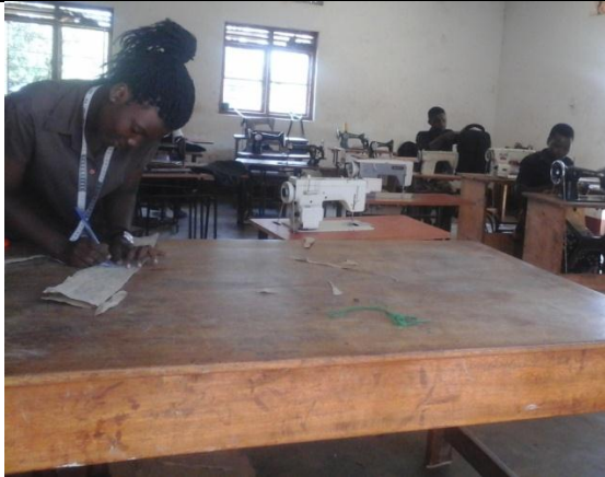
Students practicing during the tailoring sessions

The staff of UYDT conduct a land conflict resolution meeting with the community with the invited technical staff of the district