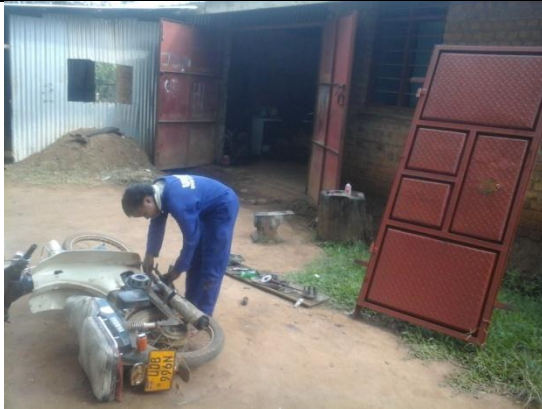
A female student learning motor mechanical work