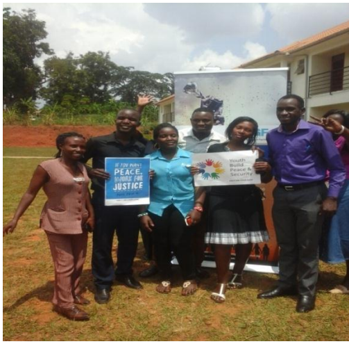
Youth who attended a workshop on peace building