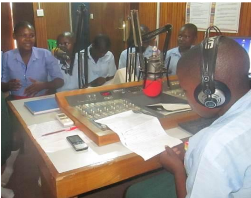
Students of different schools sensitize the communities on radio on girl child education

The institution organized 22 radio programs through partnership with a community radio station to educate the rural listeners on a broad range of topics tailored on youth and women empowerment and girl child education. The listeners who called in appreciated the importance of life skill and vocational training and also the relationship between Health and home development, how to prevent HIV and AIDS. Also as a result, the participating students developed confidence and ability to generate ideas and related actions concerning the different topics to over 1.5 million listeners.. Also it enabled students and listeners to gain knowledge and skills on how to identify and handle different forms of sickness especially where there is no doctor.