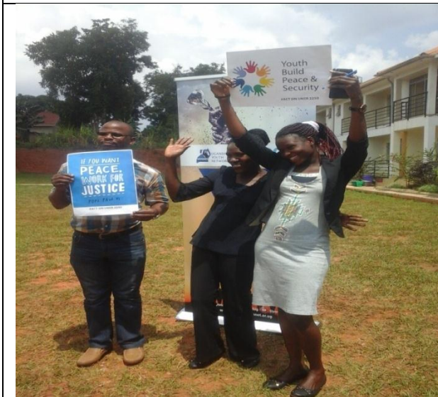
In the middle, the founder of UYDT pose for a photo during the workshop on peace building and conflict resolution that targeted 60 youth