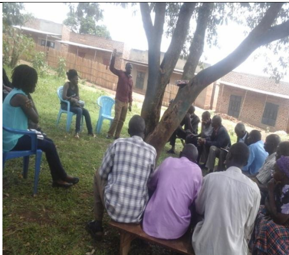
The staff of UYDT conducting a focused group discussion with the community on peace and conflict resolution.