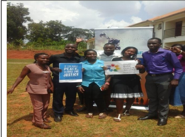
The youth who attended the workshop on peace building and conflict resolution