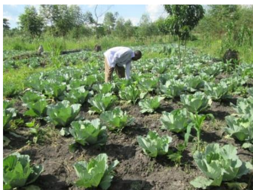
Cabbages in UYDT Demo farm

A healthy mind and body is very productive and therefore health is one of the key areas of attention in a transforming people's lives. Focus has been put on hygiene, sanitation and good nutrition. The families are sensitised to have adequate sanitary facilities like a permanent house, kitchen, drying rack, animal house, clean & safe water, clean compound, two rubbish pits for plastics and another one for degradable materials and store food in granaries. In order to have good nutrition the families are empowered to have a balanced diet with qualitative & quantitative food and be in position to have breakfast, lunch and supper. They are also encouraged to put in place kitchen garden to supplement on the food staffs. The training was done by the UYDT demonstration farm where students and farmers around come to learn and replicated the good agronomic practices their homes for better and improved health