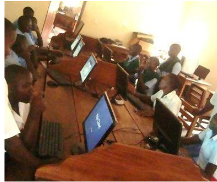
Students attend computer lessons