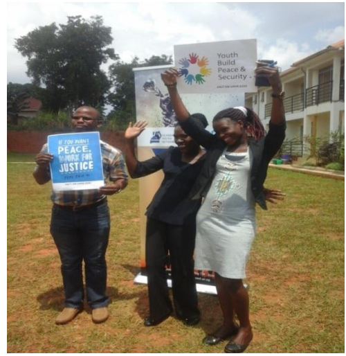
In the middle is the founder of UYDT