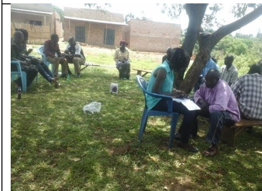
The staff administer a questionnaire (one on one) to collect data on the young people's understanding on