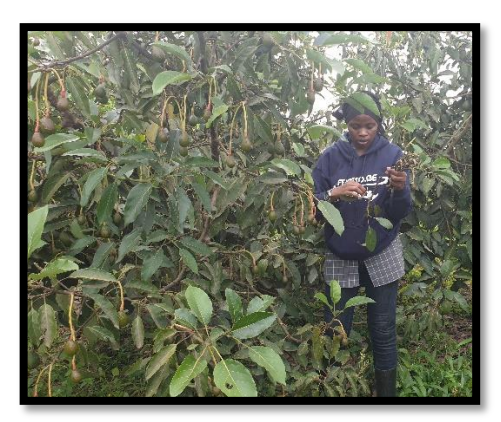
Kitchen garden starter vegetables and working the field.