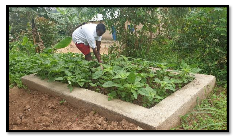
Kitchen garden, banana and fruit trees