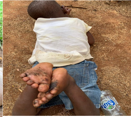
Illustration 4: jiggers infested on the soles and almost the entire leg of a two year old boy

The jiggers can spread to more than toes and nails