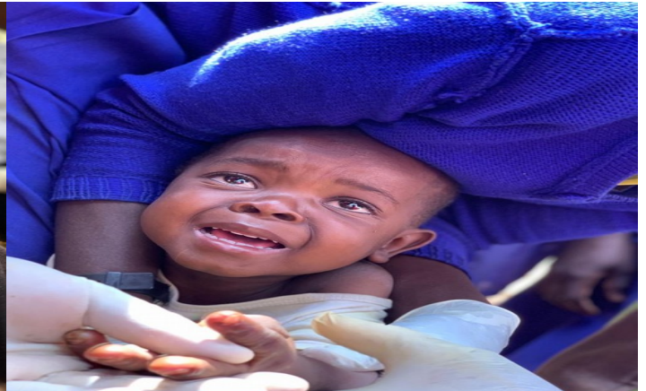
Illustration 18: Imagine a 1year old baby infested with jiggers

God bless all our donors and volunteers for participating in the noble cause, indeed, you gave hope to the needy in our society. “ The degree of loving is measured by the degree of giving” Edwin Louis.