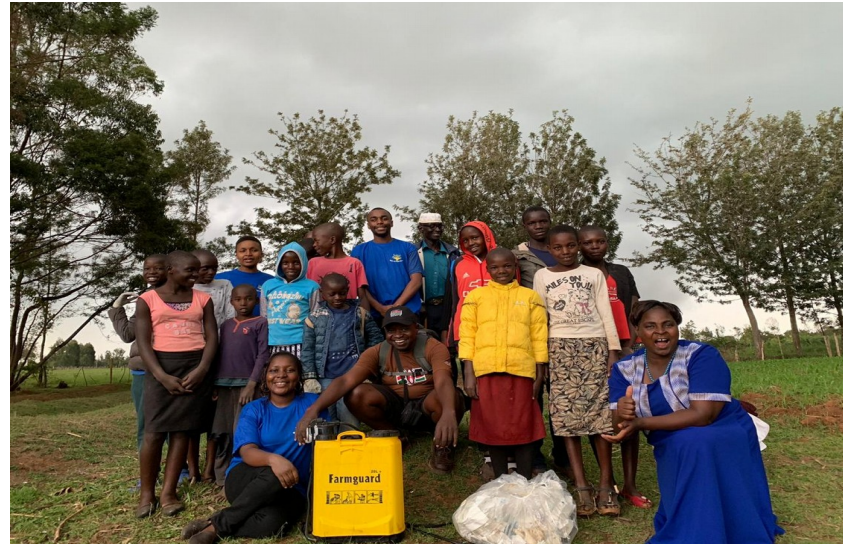
Illustration 5: A time for photo after a busy field day out for Anti-jiggers campaign