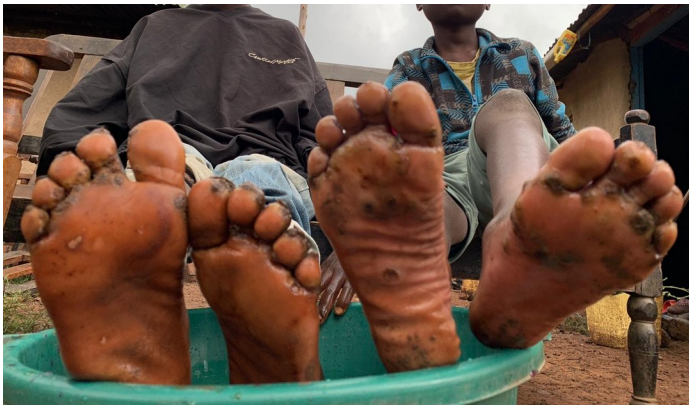
Illustration 1: The dark spots are jiggers on the 11year boys.

Rays of Care Kenya (ROCK) is a community-based organization that provides wrap-around-care to hard-to-reach populations in Kenya. We facilitate preventative interventions designed to deal with the day-to-day challenges and explore therapeutic and supportive interventions. We are a team of Clinicians, nutritionists, Psychologists and social workers, working to provide much needed support to communities in need with a special focus on youth and women. Rays of Care Kenya(ROCK) in partnership with Virtual foundation had an Anti-jiggers campaign in Aligula Village Soyi Kitale on 30 th