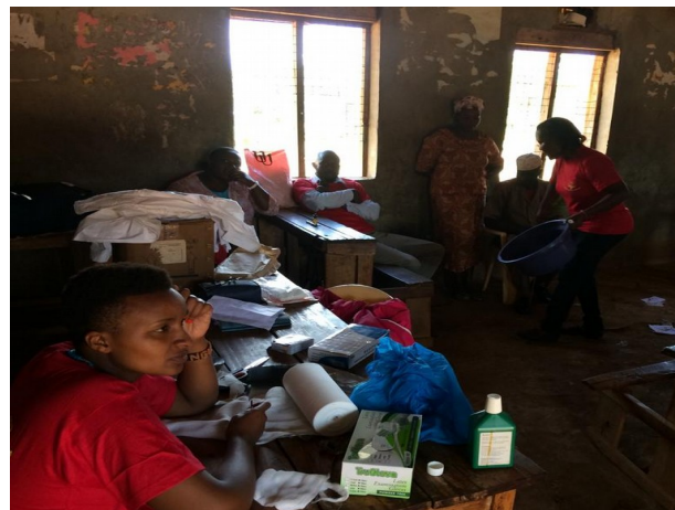
Illustration 5: setting up our drugs and equipment

One thing the ROCK team has learned throughout the camps, is to be creative and improvise as much as we can. In life you cannot have everything but you can recycle and use what you have at hand.