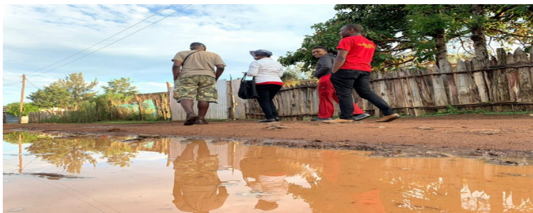
Illustration 16: ROCK team walking back to the hotel

The challenges are real in any organization. ROCK had several challenges mentioned below during the anti-jiggers campaign.