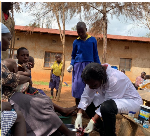
Illustration 2: ROCK Founder cutting nails of the parent before injecting the penicillin