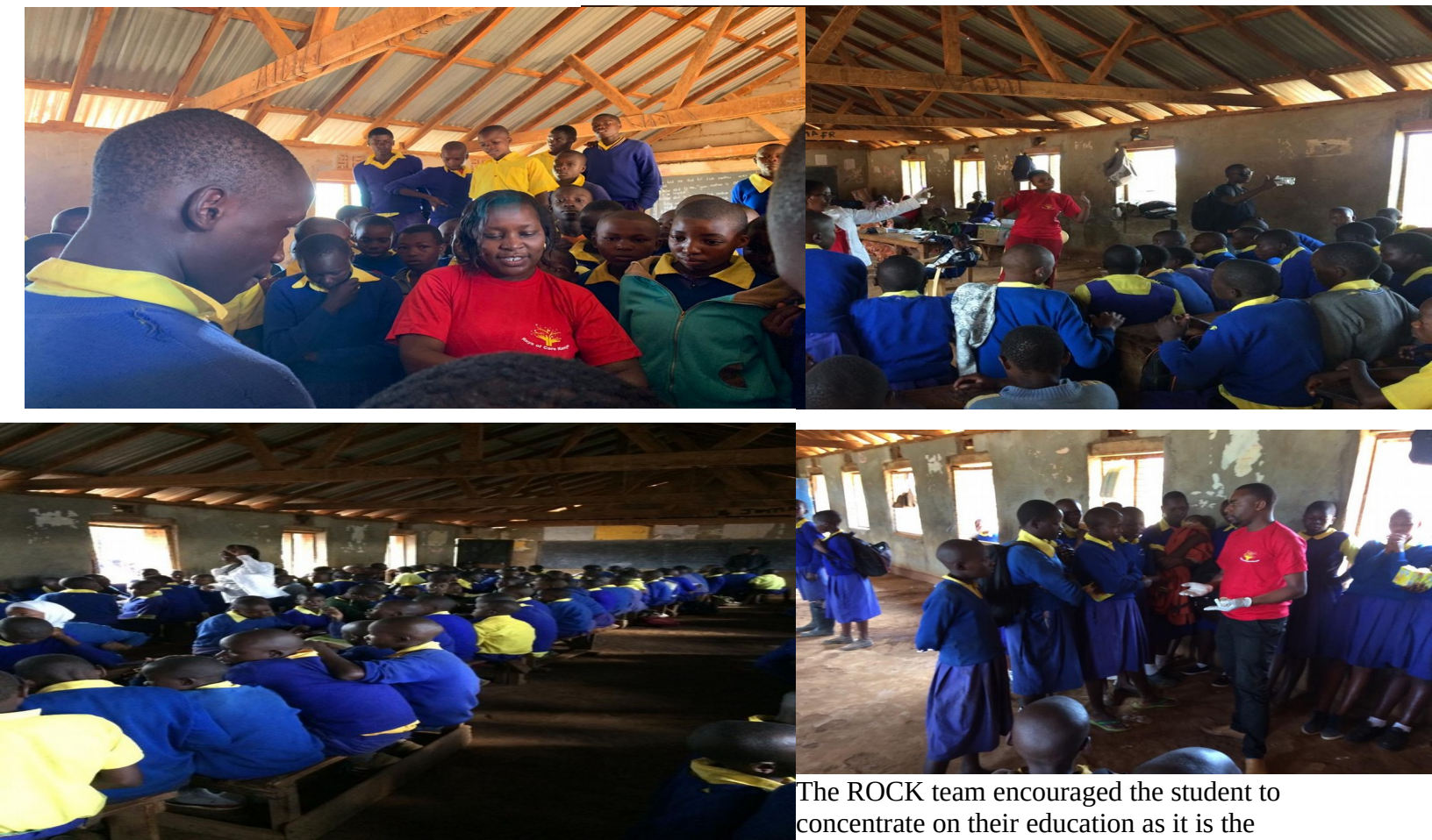
Illustration 20: The mentorship training done by all the ROCK team

The ROCK team encouraged the student to concentrate on their education as it is the key to their future. Most of the students come from very humble background.