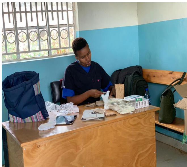
Illustration 3: The reception and triage area.

There is need for healthcare service in this place we hope to come back and have a great free medical camp to the community.