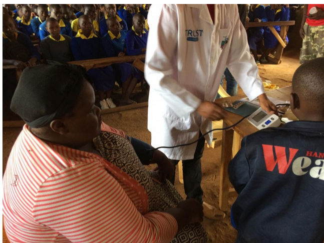
Illustration 14: This parent, blood pressure was high she was treated and given advice on diet and drugs.