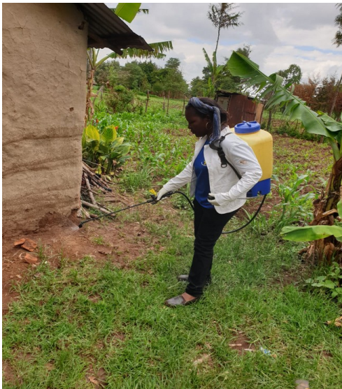
Illustration 4: The surroundings have to be fumigated too