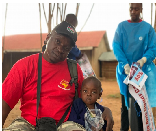
Illustration 6: The degree of loving is measured by the degree of giving. 'Edwin Louis'