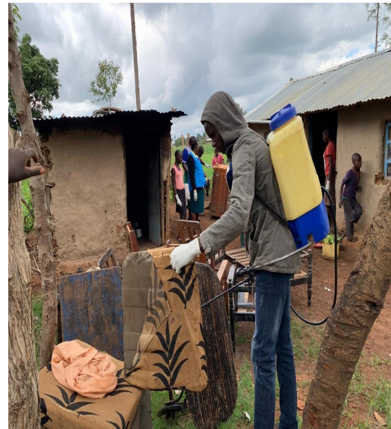
Illustration 3: All clutters in the houses are placed outside sprayed and cleaned.