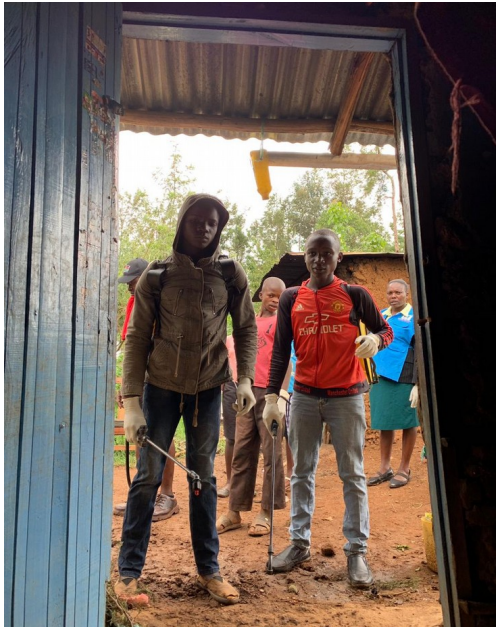
Illustration 1: The boys getting ready to fumigate the house of one of the victims.

This is done to make sure that there is no reinfection after thorough treatment of the clients. We managed to fumigate approximately 8 homes.