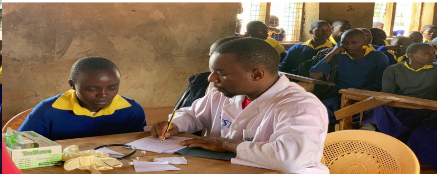
Illustration 9: Sick students were treated.