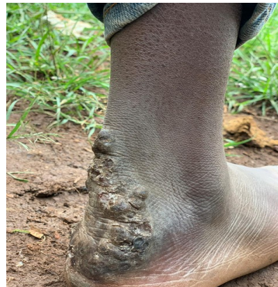
Illustration 3: jiggers infested on toes and heels