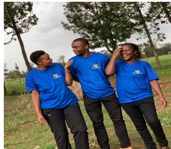
Illustration 5: Time for the Clinician to have some hearty laughter. We don't like inflicting pain but we have to sometimes.