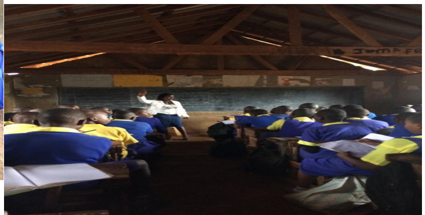
Illustration 7: Importance of knowing yourself talk