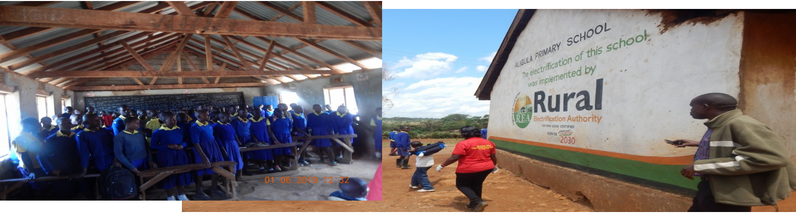
Illustration 19: Aligula primary we going to wash the latrines

The Aligula Primary has a population of over 800 students coming from the needy village of Aligula where we had gone to do Anti-jiggers campaign.