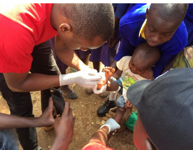
Illustration 5: 11/2 year old being removed jiggers

Those parents and children who accepted to be treated were really bold. Not many are willing to go public for help. People infested with jiggers are looked down upon hence fear stigma and discrimination.