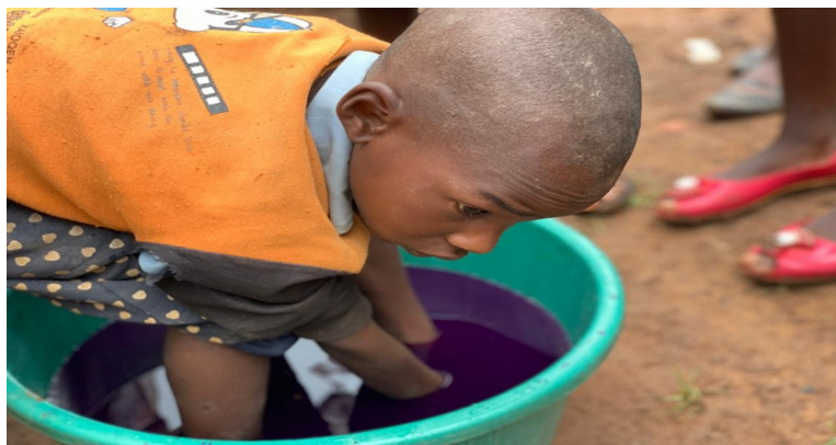
Illustration 7: After injecting with penicillin, the client has to soak the affected areas in potassium permanganet again for 30mins