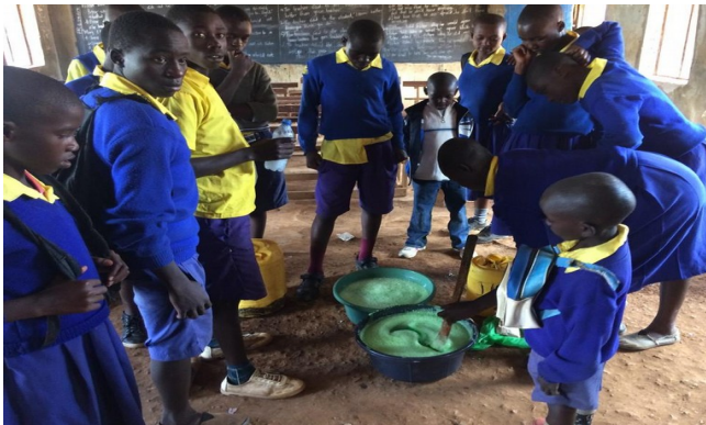
Illustration 6: detergent making process

On 30 th may 2019, we visited the Aligula primary where we had a mentorship training on self esteem, communication, values, reproduction and sexuality for class 6 to 8. It was such a great day and the students learned a lot from the team. We distribution pads to the girls, and boys were taught on importance of being their sisters keeper.