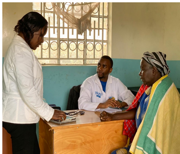
Illustration 4: The consultation room

One thing the ROCK team has learned throughout the camps, is to be creative and improvise as much as we can. In life you cannot have everything but you can recycle and use what you have at hand.