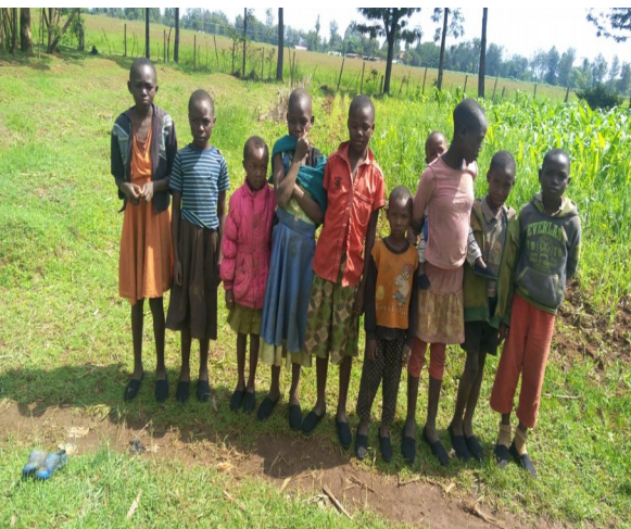
Illustration 4: Some of the children who got each two pairs of shoes to enable them walk to school.