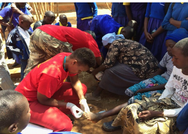
Illustration 4: It is not easy to remove jiggers from children, it calls for enough forces