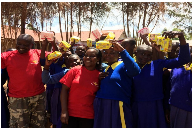
Illustration 8: We had only 50 pieces of pads