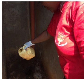
Illustration 10: cleaning of the pit latrine using students made detergent

On 31 and 1 st June 2019, the team was divided into two groups one at the Aligula dispensary and the other did home visits and fumigation of jiggers infested homes.