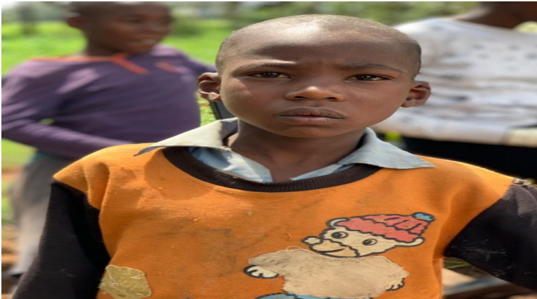
Illustration 17: The handsome boy says he wants to be a doctor, his dreams are valid

We are planning to visit the affected individuals to spray the homes at least after every three months and train the affected individuals on income generating activities. We hope and believe that with more partnership between governments, cooperates and individuals we would cover more ground in addressing the Menace.