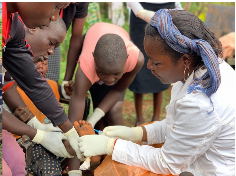
Illustration 6: Injection of penicillin to affected areas to kill and dry the wounds