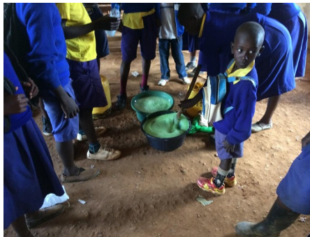
Illustration 11: Students practicing how to make soap detergent

The students trained on how jiggers is spread, the importance of maintaining good hygiene and together with the team, the students made detergents that were used to clean their school toilets.