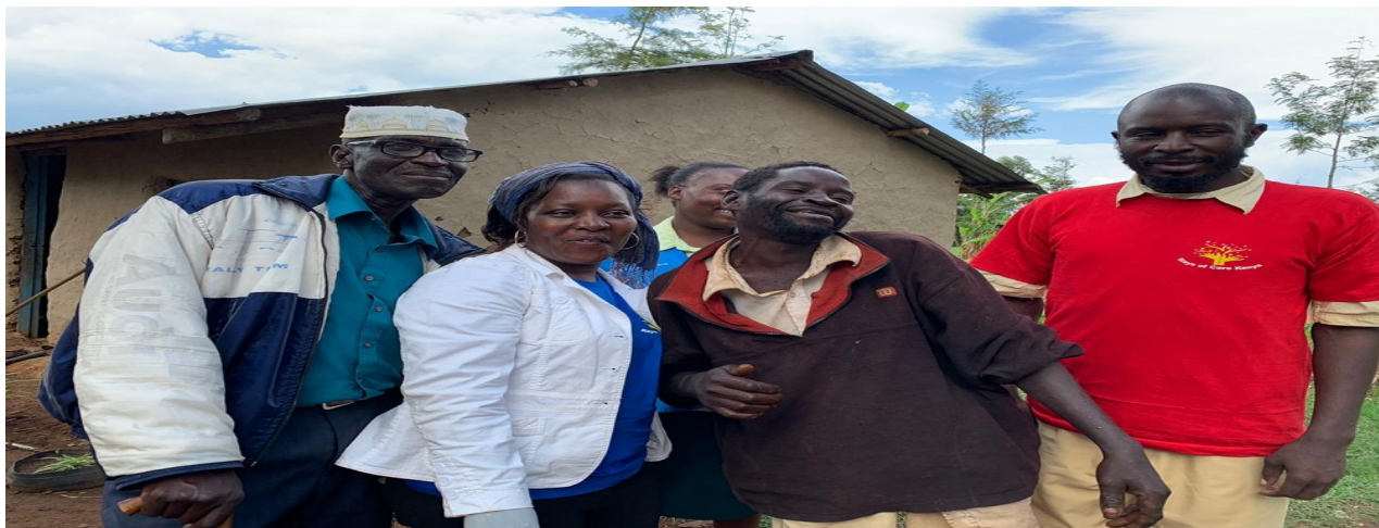
Illustration 15: The joy expressed by one of the jiggers victim after removal