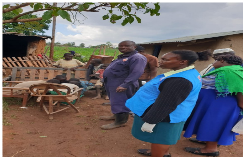
Illustration 12: All these ladies and gentlemen volunteered to work with the team