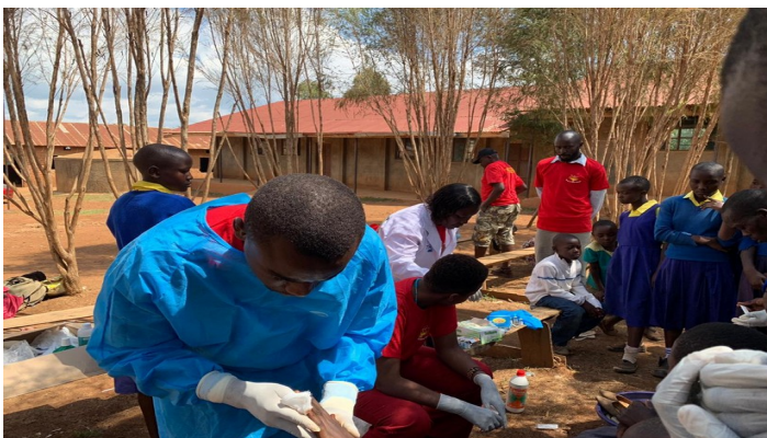
Illustration 2: The ROCK team in Red T-shirts preparing to remove jiggers