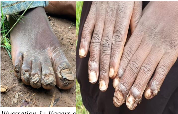
Illustration 1: Jiggers on toenail