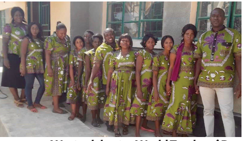
Lumwana West celebrates World Teachers' Day