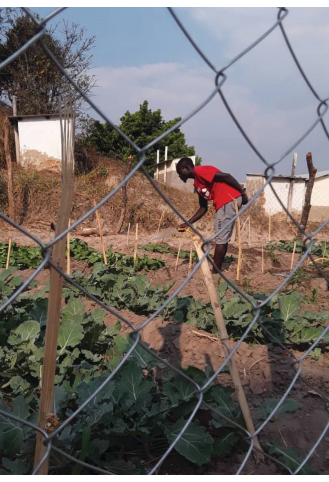
Watering the children's garden with new hose