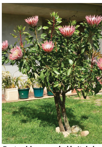
Protea blooms spied in Italy by a Library Committee member