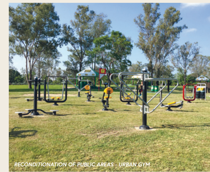
RECONDITIONATION OF PUBLIC AREAS - URBAN GYM