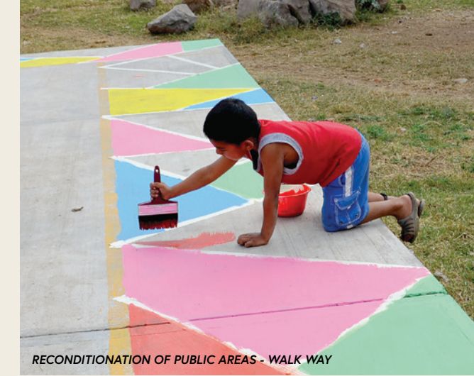
RECONDITIONATION OF PUBLIC AREAS - WALK WAY

With actions of this type we seek to invite all members of the communities: private initiative, authorities, small businesses, universities, educational centers and civil associations to participate in the rehabilitation, construction and development of public spaces for the benefit of society, under a participatory scheme in which the community exercises its right to decide about its neighborhood.