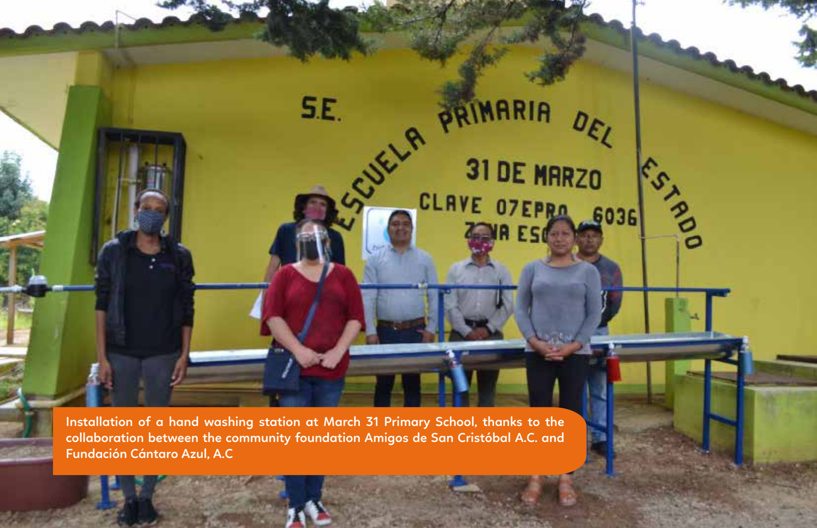
Installation of a hand washing station at March 31 Primary School, thanks to the collaboration between the community foundation Amigos de San Cristóbal A.C. and Fundación Cántaro Azul, A.C