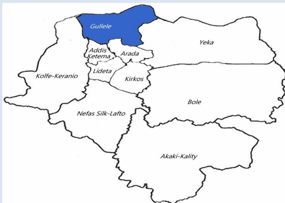
Figure 1 Map of Addis Ababa and Sub Cities

Currently, we operate at the main capital city Addis Ababa, and in one of the sub-city known as 'Gullele' found in the northern part of the town with a total population of nearly 300,000 inhabitants, where 52% of them comprises female residents. The area is where many poor women and children are found to be living in poor conditions, in different corners of this specific area. The project shall also be operational in the next strategic plan in the adjacent 'Yeka' sub city as well, to address the need of vulnerable groups in the targeted communities.