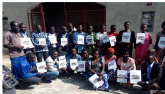
Farmers business simulation training by Charity Centre for Children and Youth Development