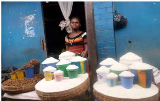
One of the beneficiaries of micro-loan support in Solwezi District of Zambia