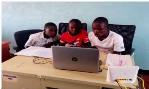
We provided virtual learning during school closures and providing free internet to vulnerable students

We envision a society that will work towards the eradication of poverty, HIV and AIDS, illiteracy among Orphans and vulnerable children, youths and women in Society.