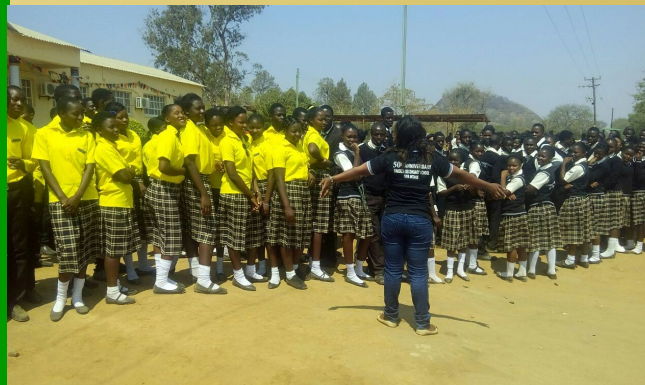
Through HERVoice Fund: Strengthening Adolescent Girls and Young Women's Voices in National related Policies and Programming process in Chadiza District