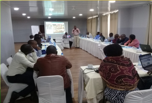
Capacity Building on Internet Skills