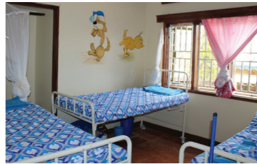
Comfortable Accommodation We provide accommodation for child & caregivers