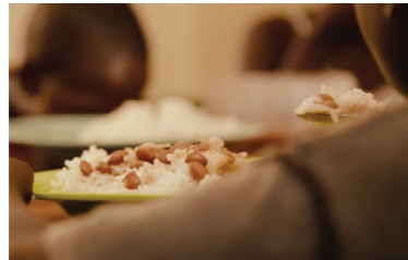
Nutritious Meals We provide 3 nutritious meals everyday.