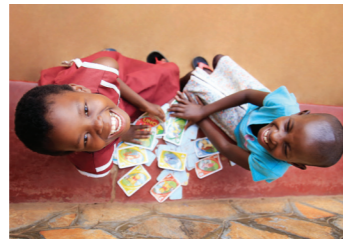
A secure and safe home environment