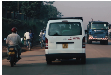
Transport to & from the hospital for treatment.