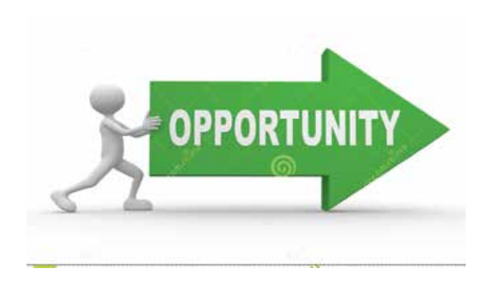
Opportunity: no one is less or incapable if chances are given