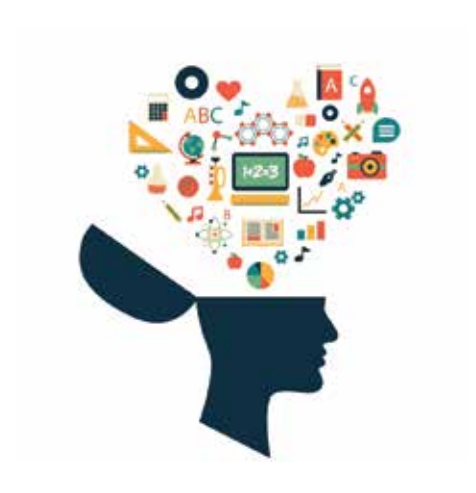
Knowledge: instrument to tackle vulnerability/ poverty