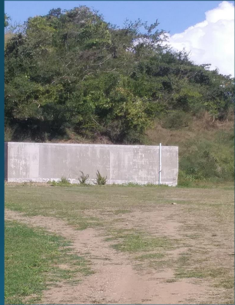
Irrigation/ water system