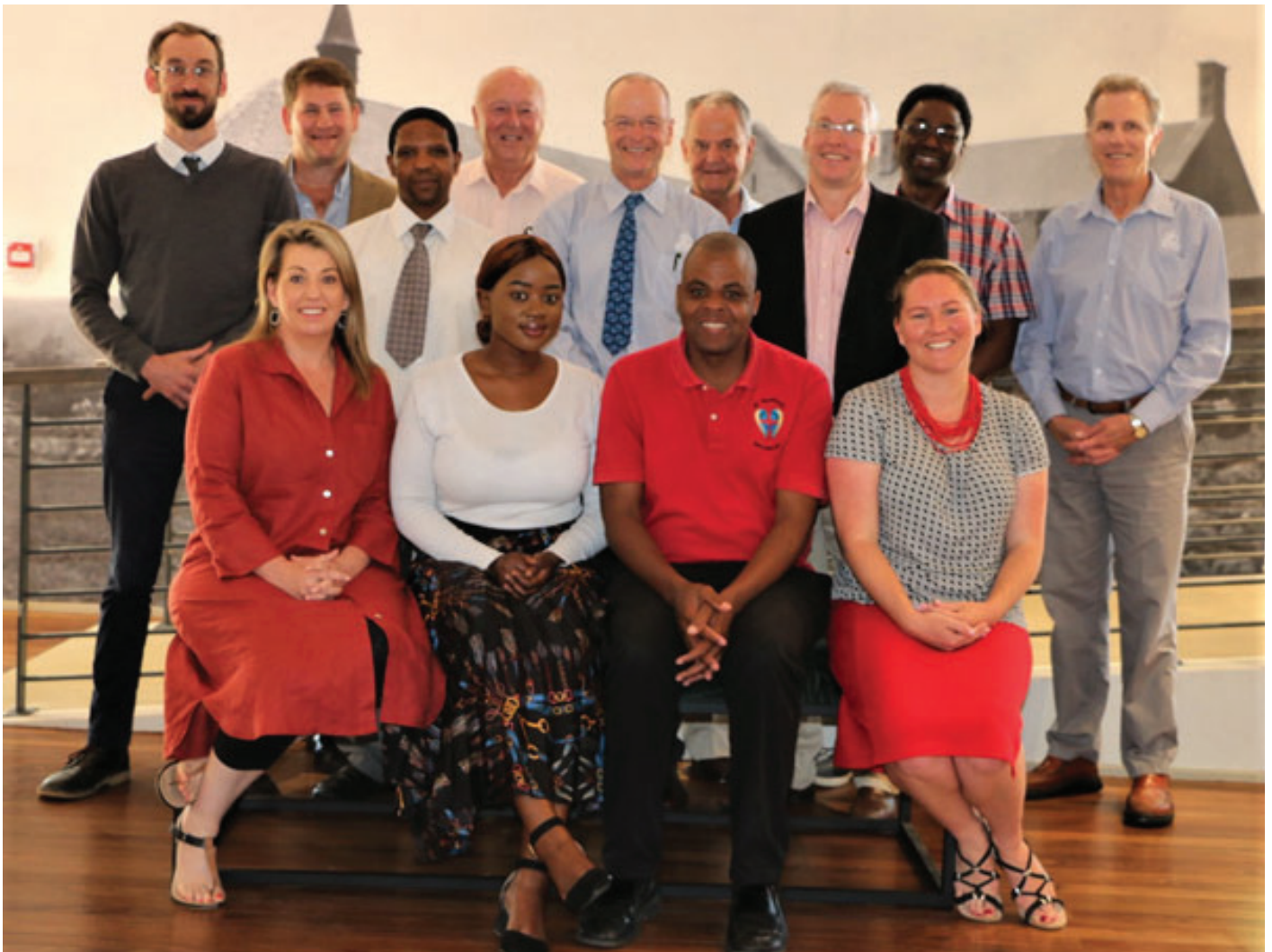
CPT team, trustees and volunteers

The Michaelhouse Community Partnerships Trust (“CPT”) is a registered non-profit organisation ( NPO: 015292 ). The CPT partners with 18 community schools located between Lions River and Mooi River, within 30 minutes’ drive from Michaelhouse to improve their functionality as places of learning. This requires Principal and teacher development, classroom management and subject specific training. We engage with the Department of Education, the Circuit managers and the community to ensure that our program is child centred and holistic. We focus on the specific needs of each school to ensure we maximise our contribution. We measure our success by assessing progress of school functionality and the exam pass rates. CPT staff supported by a committee of Trustees and committed volunteers, oversee a range of projects covering literacy, numeracy, sport, the arts and culture, healthcare and IT.