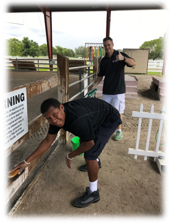
Our deepest thanks to...

Citrix Systems · Church of Jesus Christ of Latter-Day Saints · The Florida Society of Engineers—Broward County · Phoenix Tower International · Pine Crest Middle School · St. Andrews School · Rotary Club of Coral Springs · Saint Andrews School · Stantec Consulting