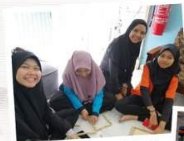
Upcycle Lamp Workshop with Rumah Nur Qaseh By Nur Hidayah 環保燈制作活動