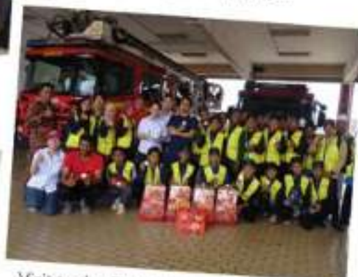
Visit to the Fire Station with Rumah Amal Limpahan Kasih by Sadam Hussein 消防局學習之旅