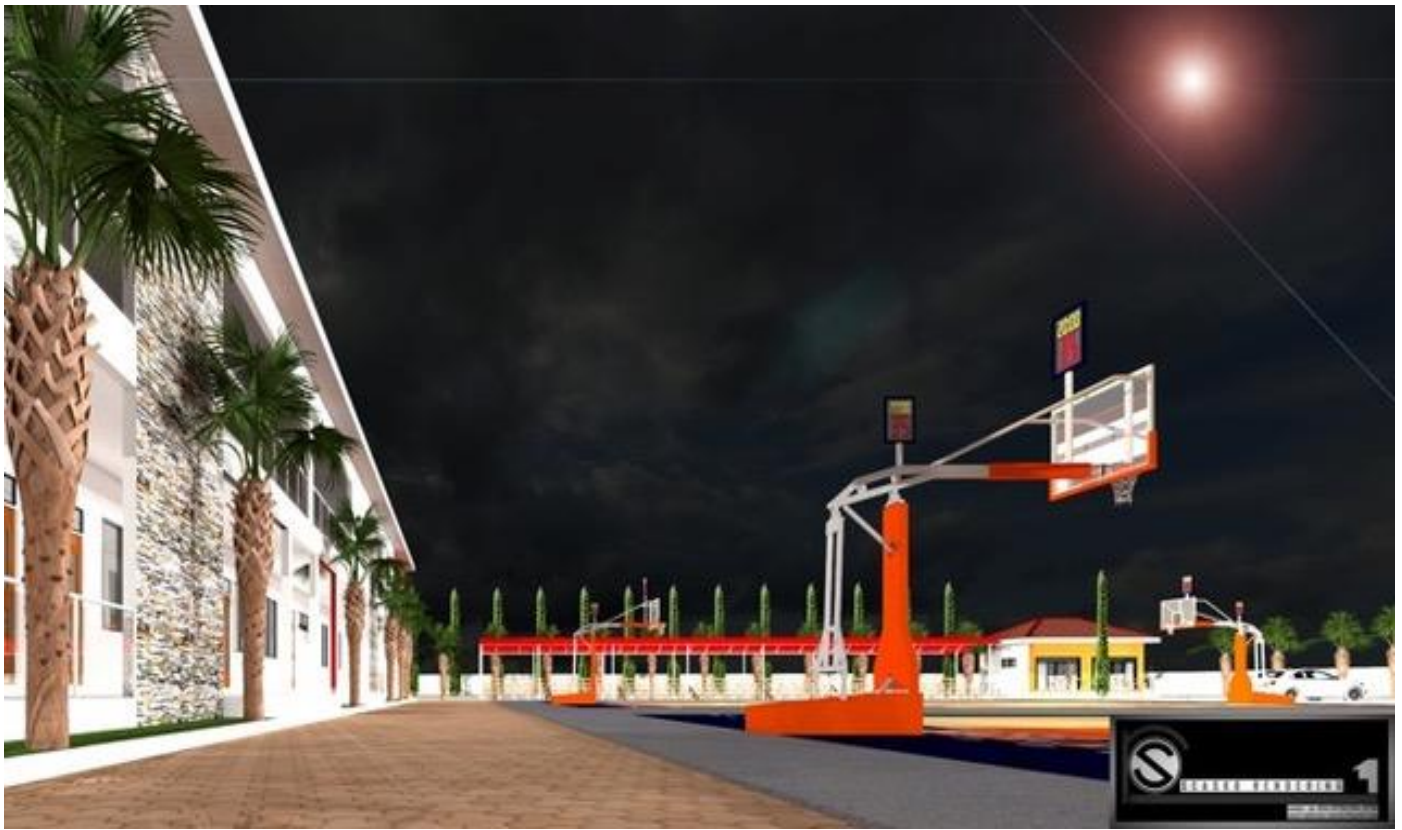
YETS Ghana current Location at Save Our Lives Ghana. A basketball court constructed by the YETS Foundation, Holland in 2013.