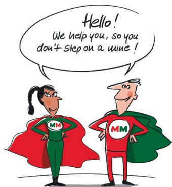
What can happen if I step on a mine?

Currently, the cartoons are available in 3 languages: Azerbaijani, Ukrainian and English.