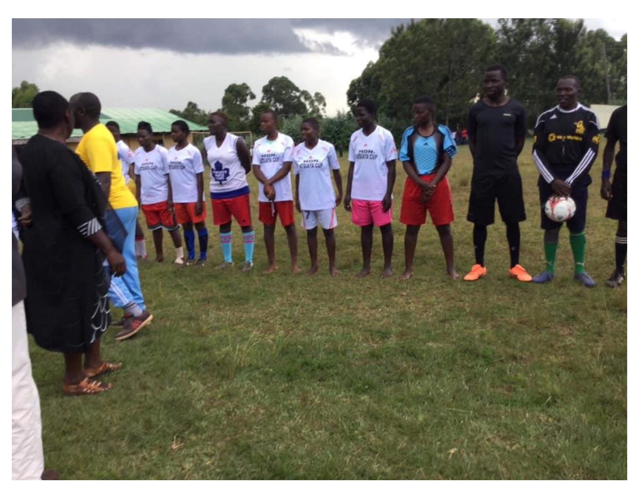
YF Administrator Commissioning The 2019 YF Football Tournament Cup Girls Final Match – Stars Vs Queens.