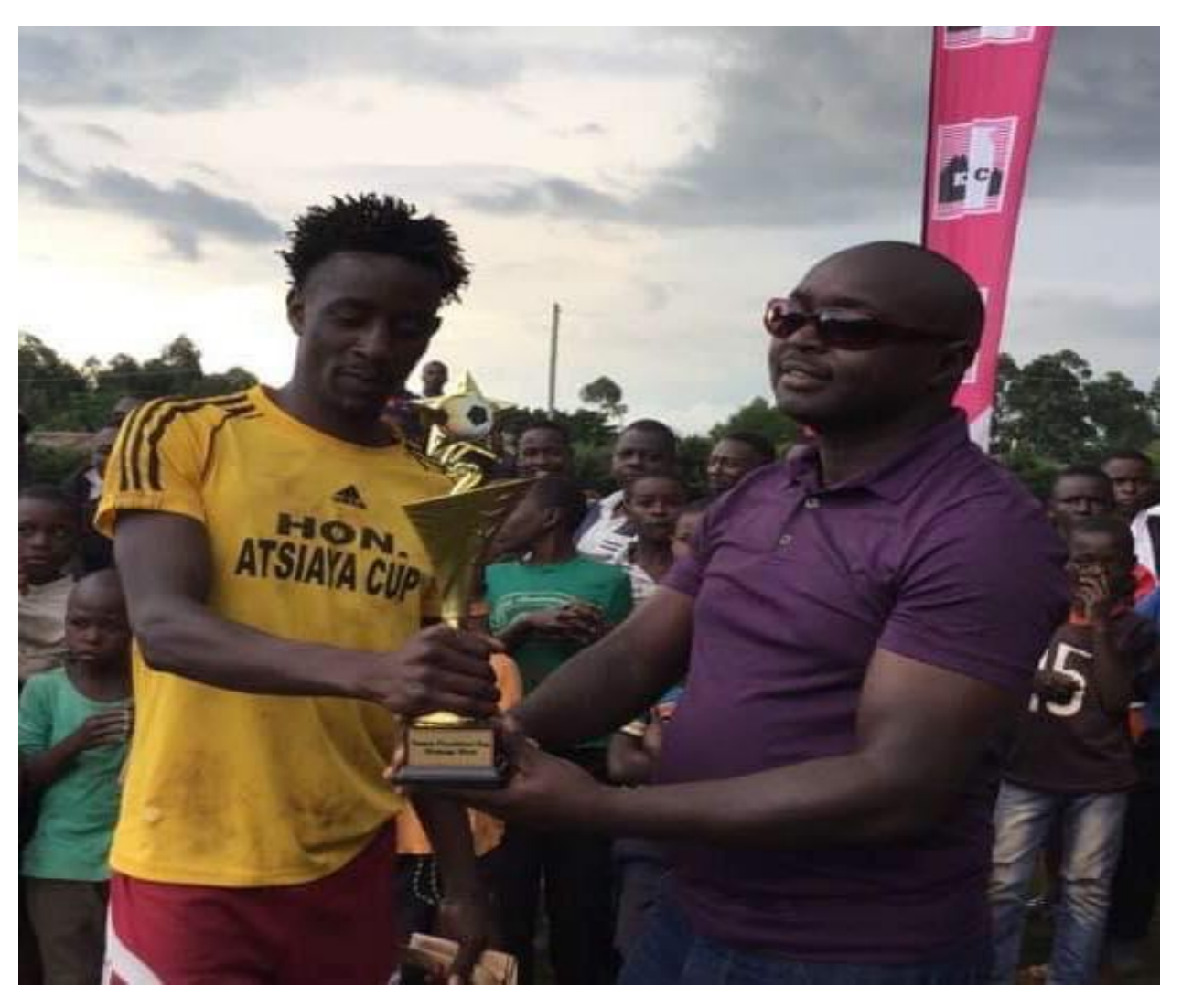
2019 YF Football Tournament Cup Trophee Being Handed Over To The Boys Champions Team Captain (Galaxy United FC) By The YF-CEO.