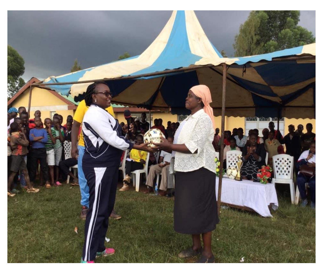
YF Director Awarding Girls Football Teams That Participated In The 2019 YF Football Tournament Cup.