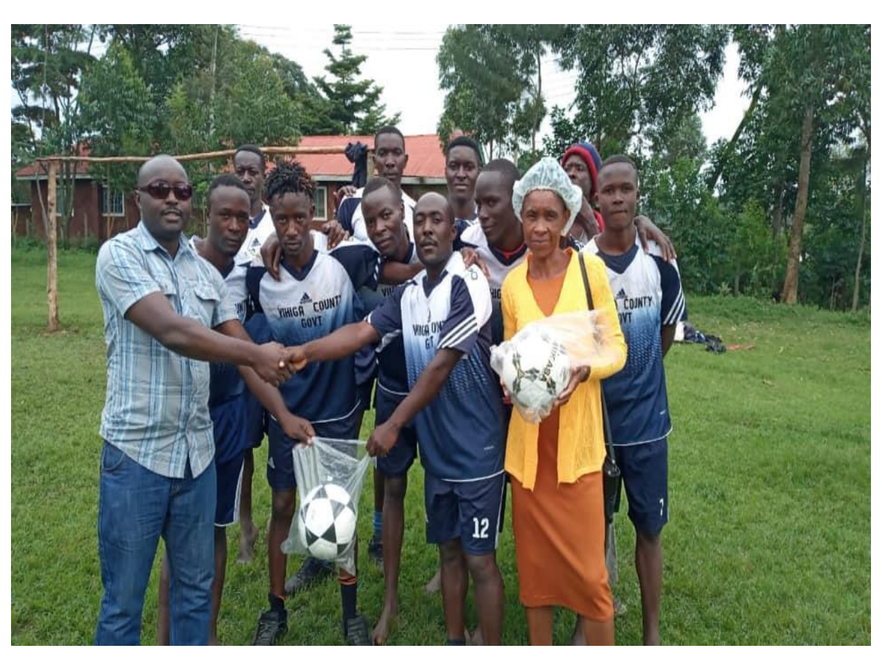
Launching of the 2019 YF Football Tournament Cup by the YF -CEO (Gaigedi FC).