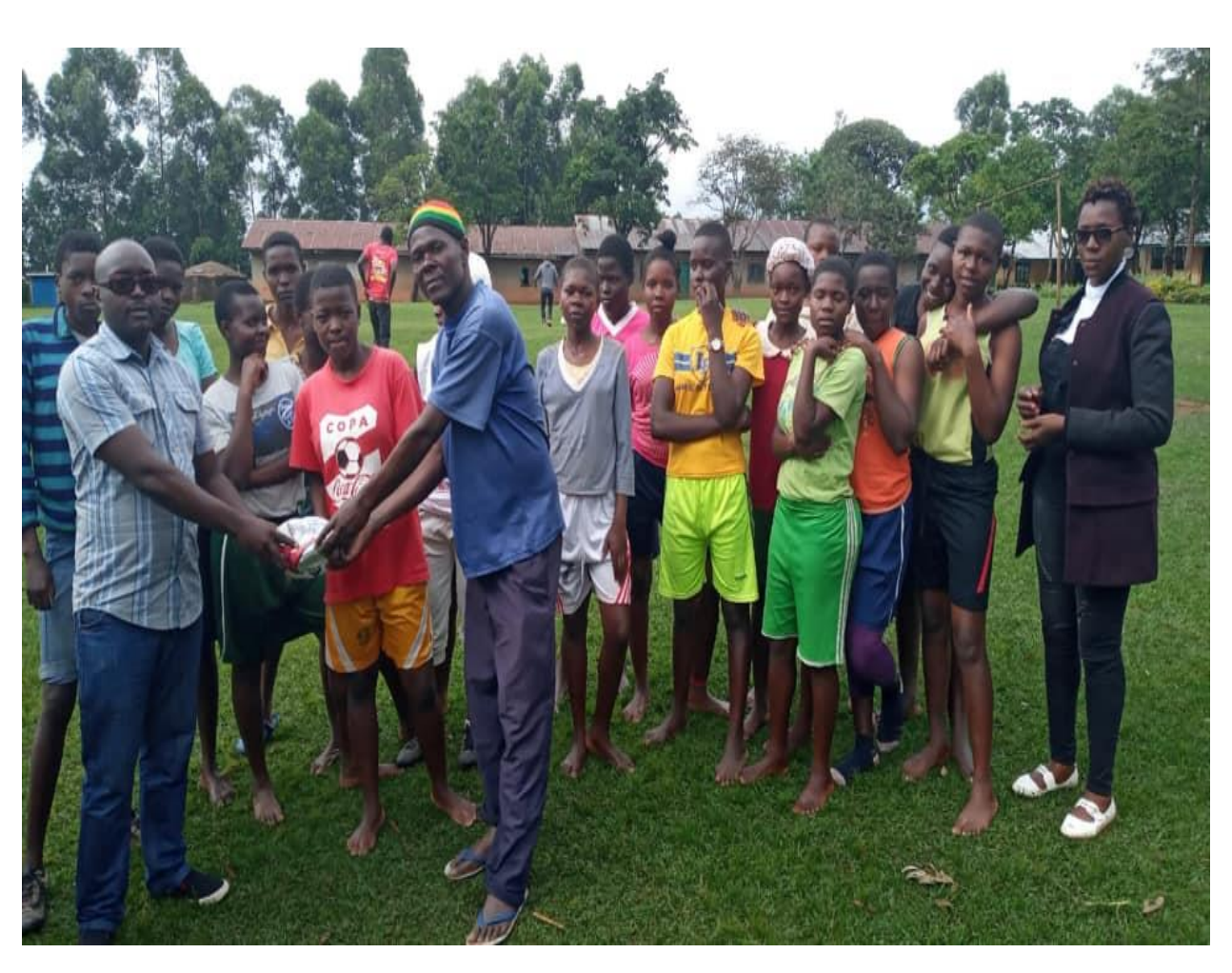
Launching of the 2019 YF Football Tournament Cup by the YF -CEO (Queens FC).