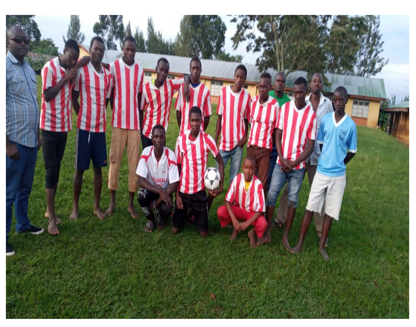
Launching of the 2019 YF Football Tournament Cup by the YF -CEO (Lusengeli FC).