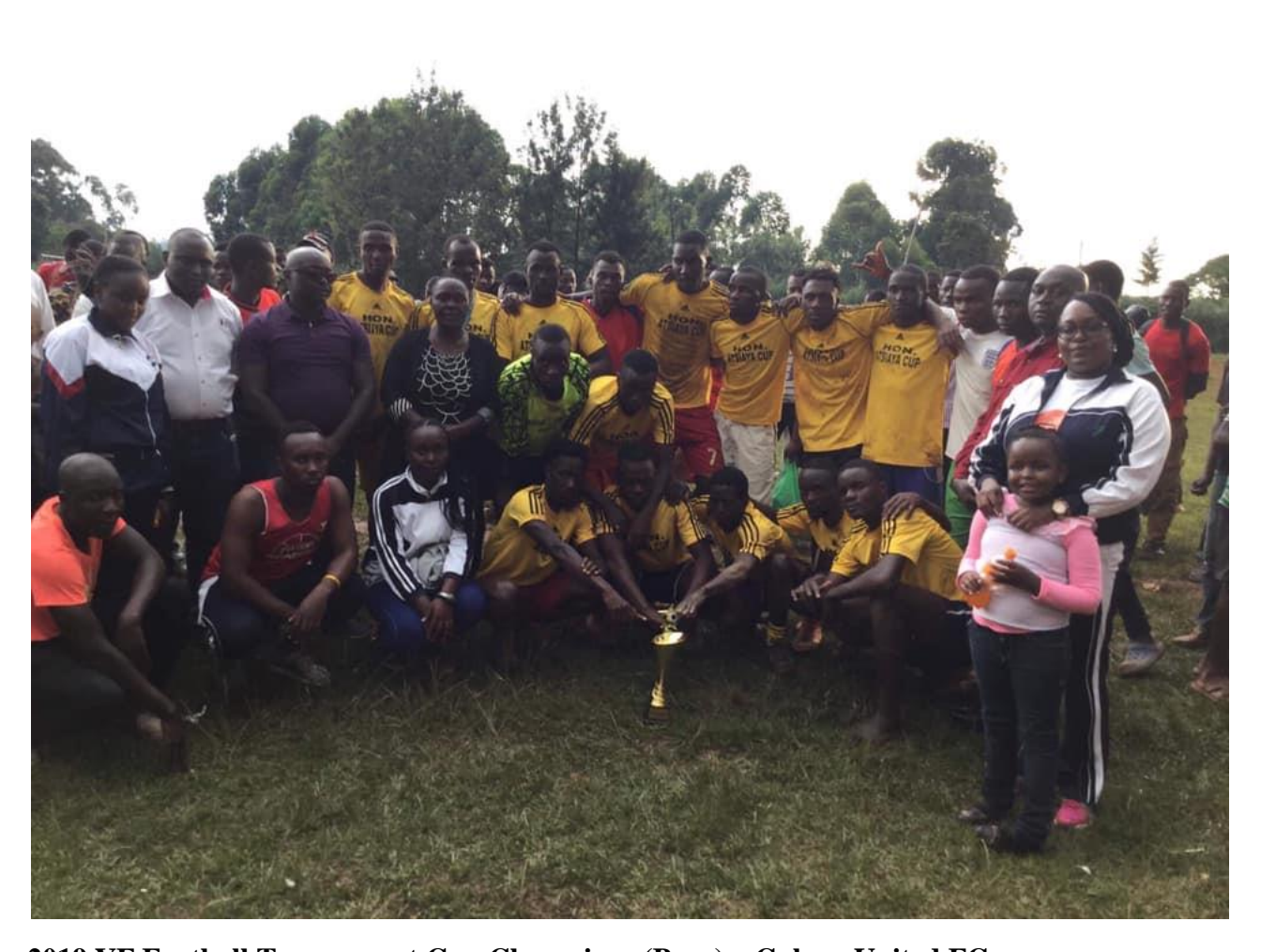
2019 YF Football Tournament Cup Champions (Boys) - Galaxy United FC.