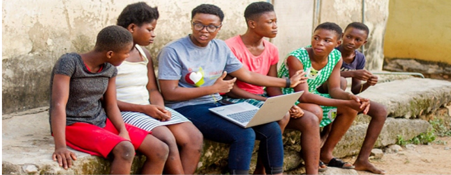
Girl child education is our strategic development priority in Ghana and Africa. AHSA LIFE Team have inspired 68% Girls in the rural areas of Ghana.

Also, we have procured sanitary pads which we would be giving to females to curb the situation of avoiding school when they are in their menstrual periods.