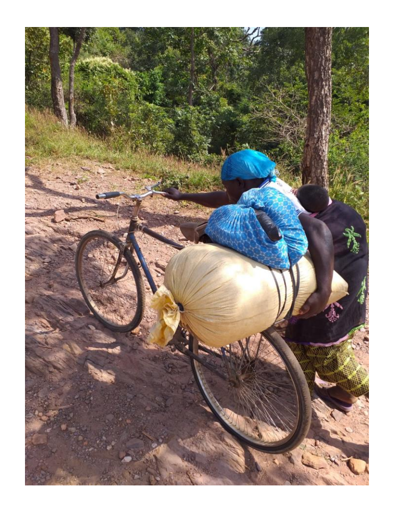
On the way to the market

As everywhere in Burkina Faso, women in Dodougou devote more than half of their time to agricultural work. To support themselves and the children, and to cope with the uncertainty of the harvests (draught, insects, soil erosion, lack of processing plants) they also do small business: manufacturing of millet beer, processing and selling of agricultural products. Unfortunately, the revenues from these activities do not allow them to meet all their and the family's needs. The lack of an, even small, capital to be invested, prevent from a consistent pursuing and from a diversification of the income-generating activities.