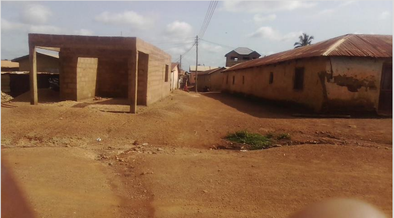
Caption 1.1, inserted picture of a suburb of Nkwanta Township

establish their own business, and be able to put a three daily square meal on their table. In addition, these single mothers will be able to take care of the basic needs (medical care, clothing, and feeding, academic materials) of their children.