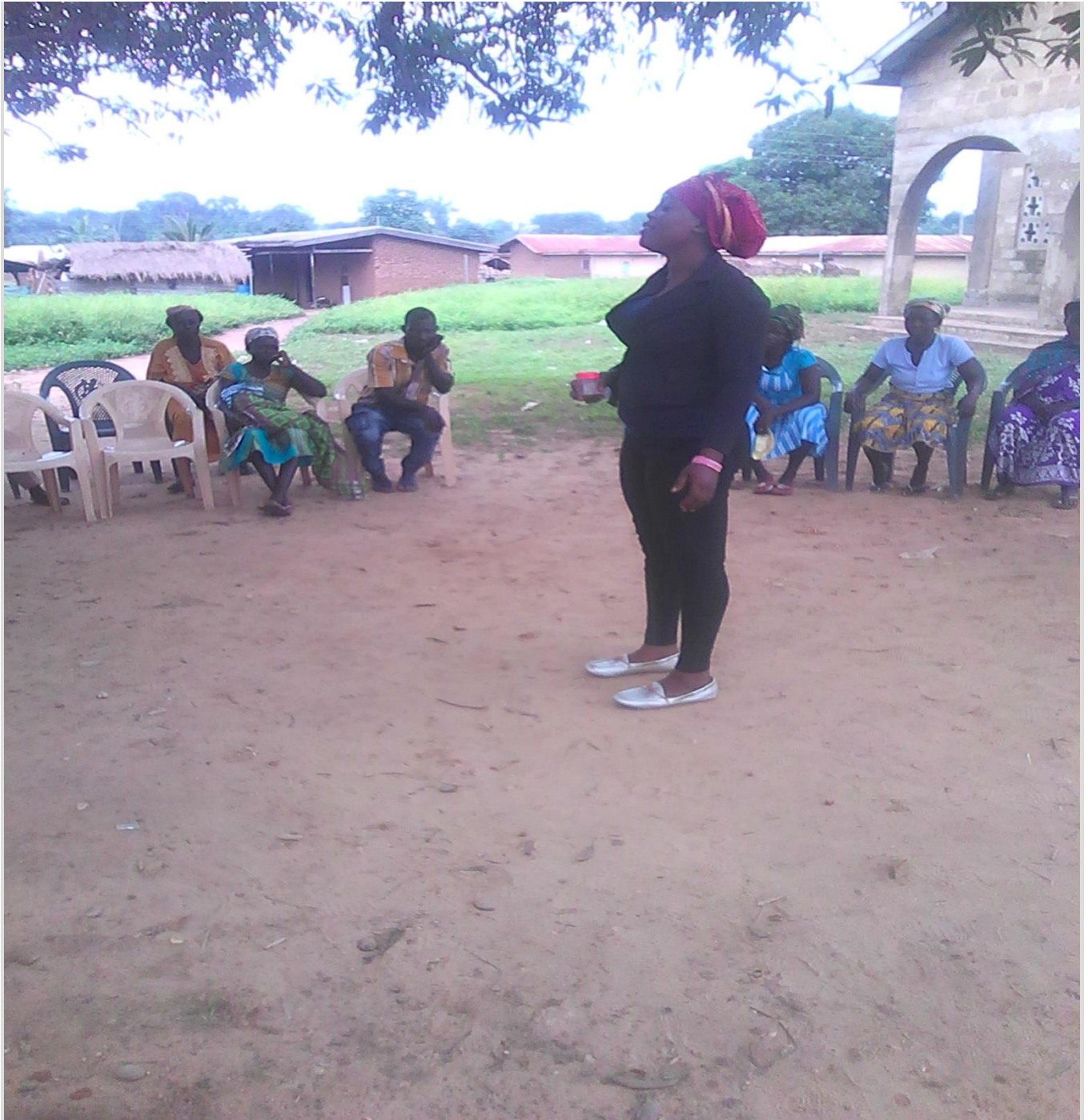
Health education in one of the communities