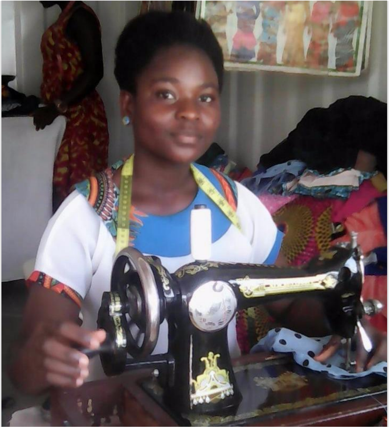
Beneficiary of lifeway support