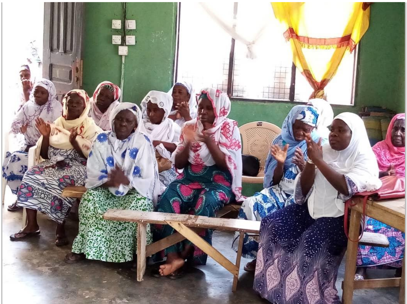
Guardian counseling for single parents –women in a Nkwanta Zongo community