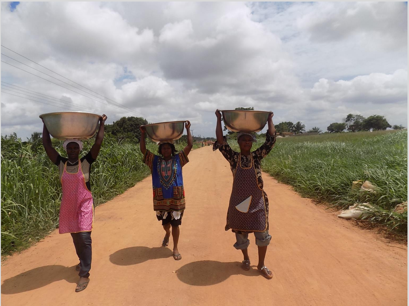
Caption 1.2, inserted picture of how single mothers need to fetch water to a construction site in order to get some money to feed with their children

Establishing of a dressmaking resource center will help empower over 150 single mothers and teenage girls with on the job-trained skills on dressmaking of which will help them establish their own business, and be able to put a three daily square meal on their table. In addition, these single mothers will be able to take care of the basic needs (medical care, clothing, and feeding, academic materials) of their children and themselves. Their children will also be enrolled in school.